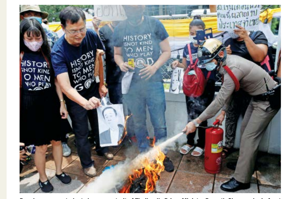
Pro-democracy students burn a portrait of Thailand's Prime Minister Prayuth Chan-o-cha in front of the Government House in Bangkok, Thailand, yesterday.

The Chinese foreign ministry yesterday said the speech by Pompeo on China ideological bias.