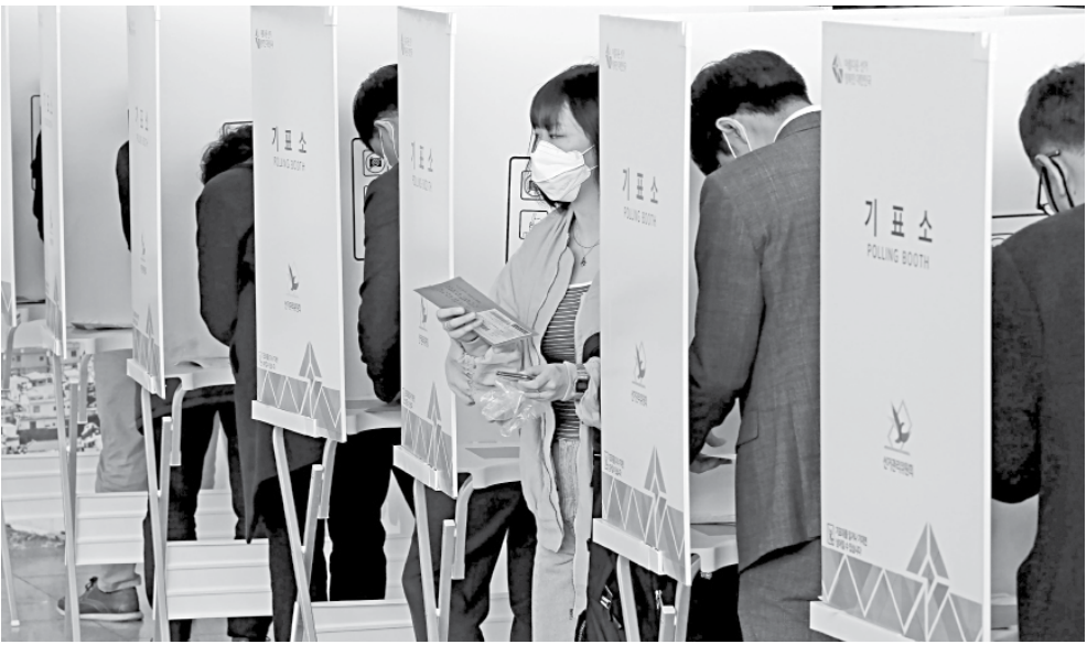
A woman wearing a mask to prevent contracting the coronavirus leaves a voting booth to cast her absentee ballot for the parliamentary election at a polling station in Seoul, South Korea, on April 10, 2020.

Hungary declared a state of emergency due to Covid-19 on March 11. Later, despite courageous protests from local human rights groups, the Bill on Protection