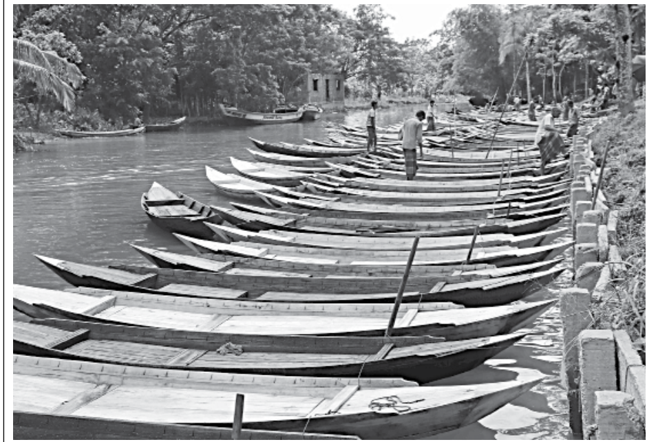
Boats are kept in a row for sale at Noukar Haat on Atgar canal in Pirojpur's Nesarabad upazila. Boats of different sizes are sold at the haat every Friday during monsoon. Farmers buy the boats to collect, carry and sell guavas and hog plums in the floating markets. But this year, the sale of boats falls drastically due to coronavirus outbreak.

This year, guava has been cultivated on 657 hectares of land while hog plum on 350 hectares of land, said the officer.