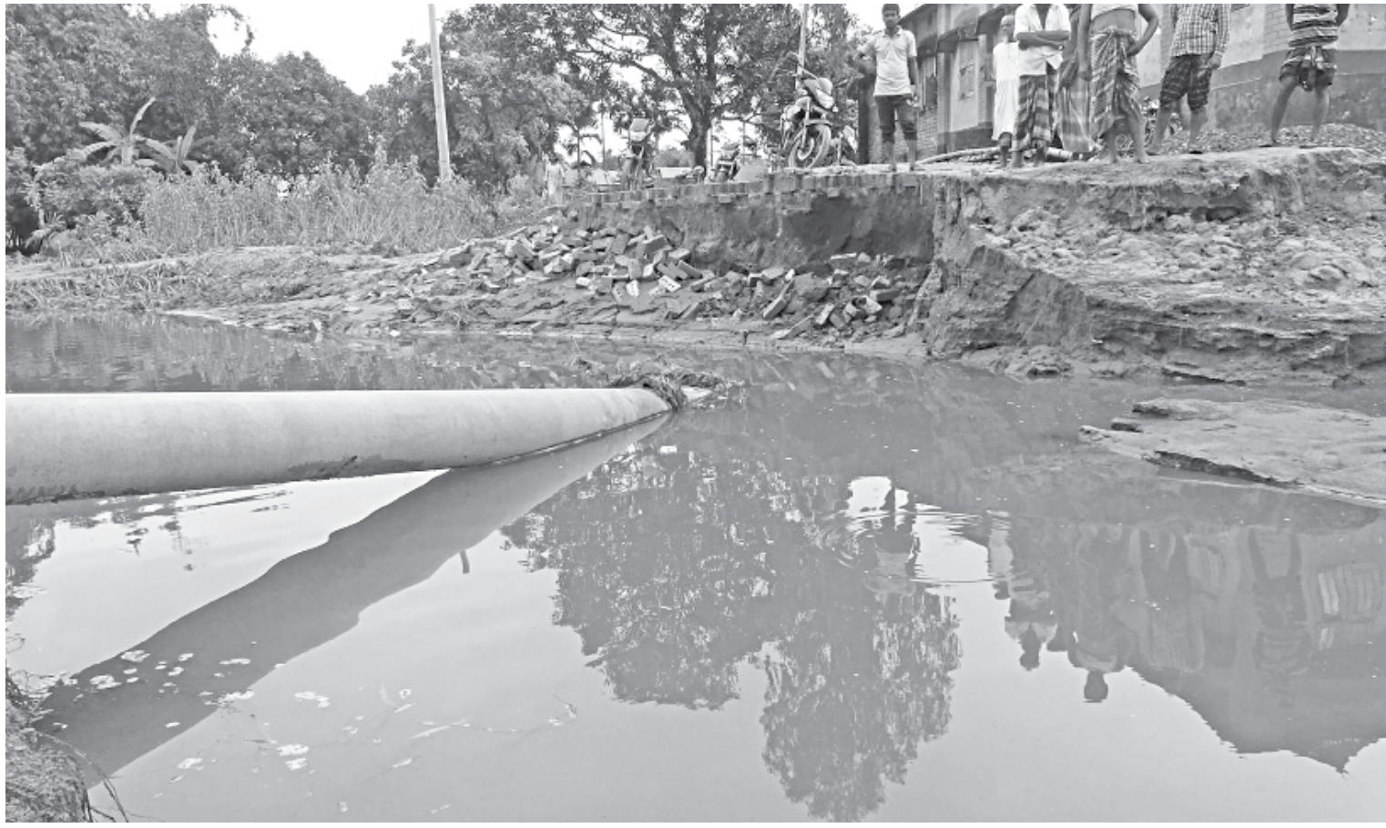
A flood-ravaged road in Dahagram union under Lalmonirhat's Patgram upazila.