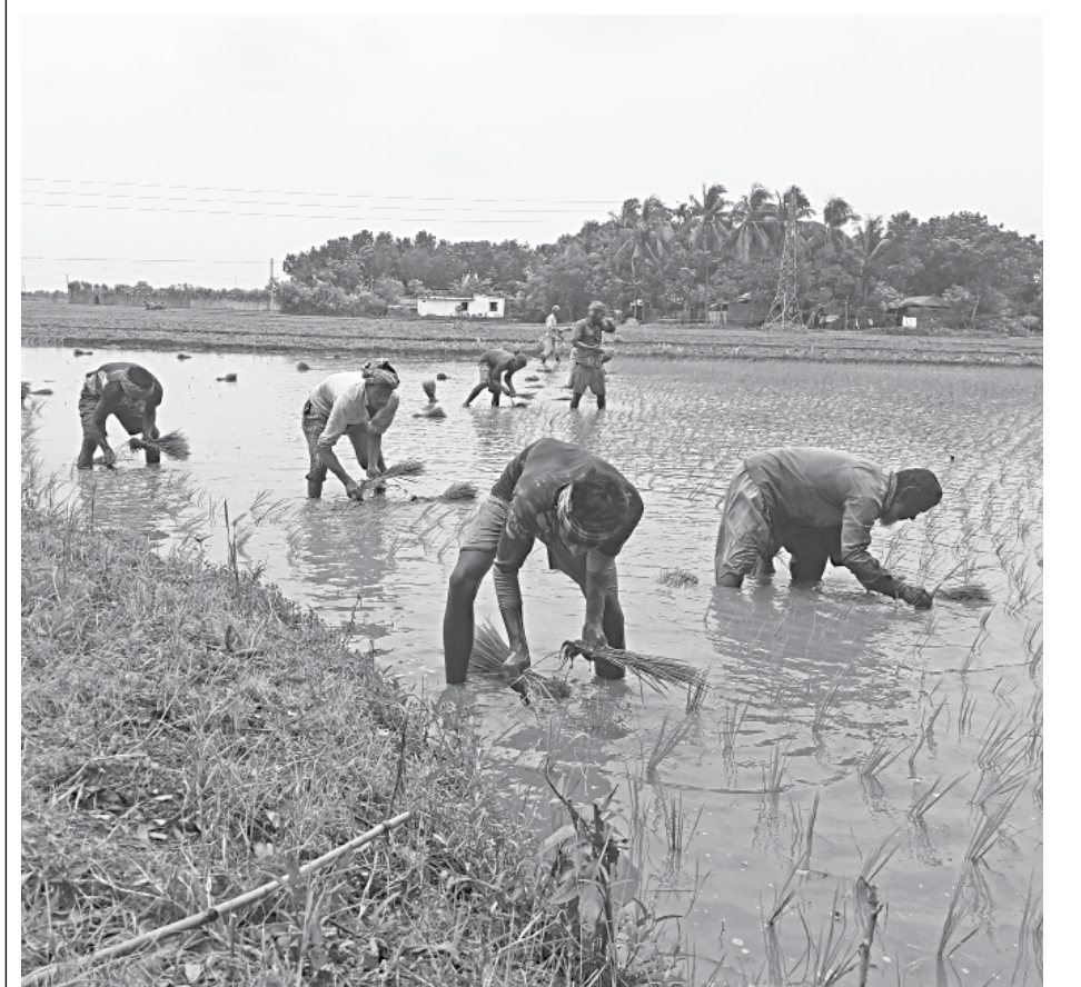
Farmers plant Ropa Aman paddy at a field in Bejpara village of Jhenidah's Kaliganj upazila.