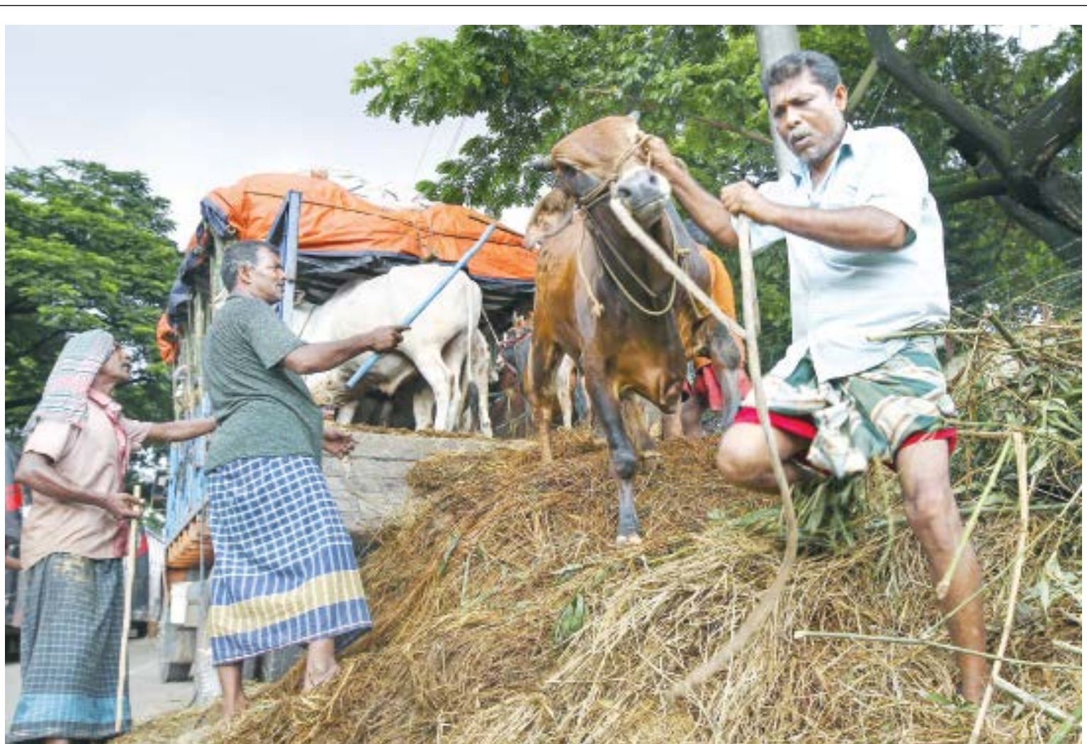
Cattle traders bringing cows to Sagorika market by trucks in Chattogram city. Truckloads of sacrificial animals have been arriving in the port city from different districts for the last few days as the Eid approaches.