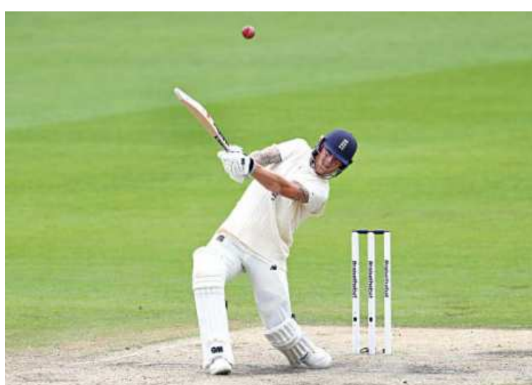
England fast bowler Stuart Broad celebrates the wicket of West Indies batsman Shai Hope during the final day of the second Test at Old Trafford, Manchester yesterday. West Indies lost both their opening batsmen early and were 25-3 at lunch after England declared in the first session to set the visitors a target of 312. Earlier, England resumed on their overnight score of 37-2 and Ben Stokes (L) got straight into action, looking to cart the West Indies bowlers all around the empty stadium during his unbeaten 57-ball 78.

Rahm said the moment was difficult to comprehend in part because his thoughts were with his family, two members of which have died from COVID-19.