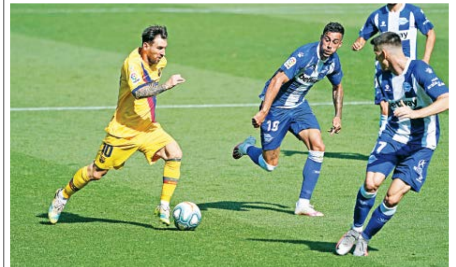
Barcelona's Lionel Messi takes on a host of Alaves players during their last match of the La Liga season on Sunday. The Argentine superstar may have seen his side relinquish the title but he grabbed the top scorer's award for a record seventh time with 25 goals.

The IBC Board will also continue to evaluate the situation in relation to being able to stage the ICC Women's Cricket World Cup 2021 in New Zealand in February next year. In the meantime, planning for this event continues as scheduled.