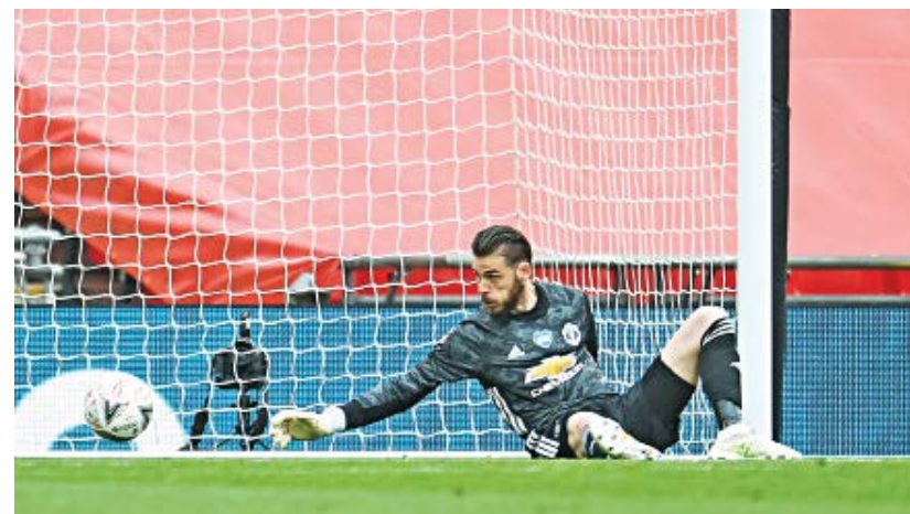
Manchester United goalkeeper David de Gea lets one slip through his hands during their 3-1 defeat against Chelsea in the FA Cup semifinal on Sunday, prompting many to once again call for his axe from the Red Devils' No 1 goalkeeping spot.

United manager Ole Gunnar Solskjaer described De Gea as