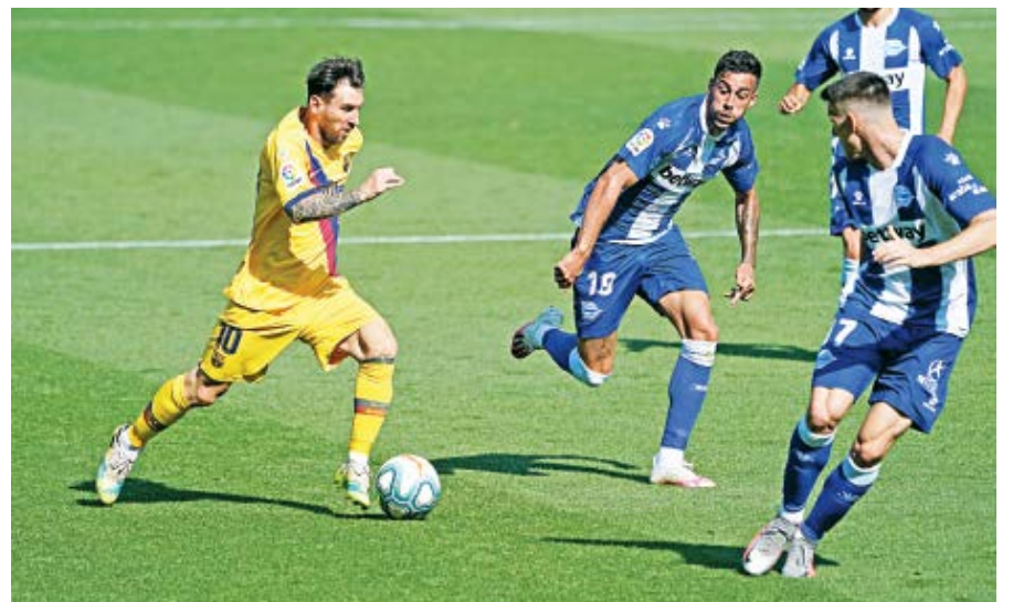
Barcelona's Lionel Messi takes on a host of Alaves players during their last match of the La Liga season on Sunday. The Argentine superstar may have seen his side relinquish the title but he grabbed the top scorer's award for a record seventh time with 25 goals.

The IBC Board will also continue to evaluate the situation in relation to being able to stage the ICC Women's Cricket World Cup 2021 in New Zealand in February next year. In the meantime, planning for this event continues as scheduled.