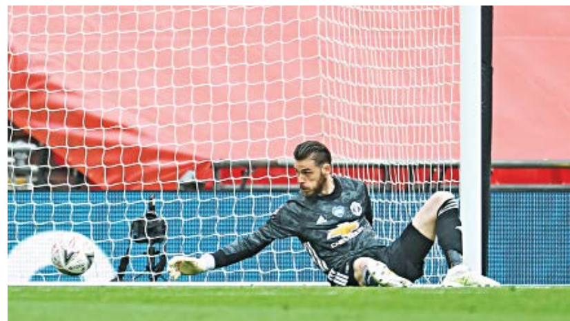
Manchester United goalkeeper David de Gea lets one slip through his hands during their 3-1 defeat against Chelsea in the FA Cup semifinal on Sunday, prompting many to once again call for his axe from the Red Devils' No 1 goalkeeping spot.

United manager Ole Gunnar Solskjaer described De Gea as