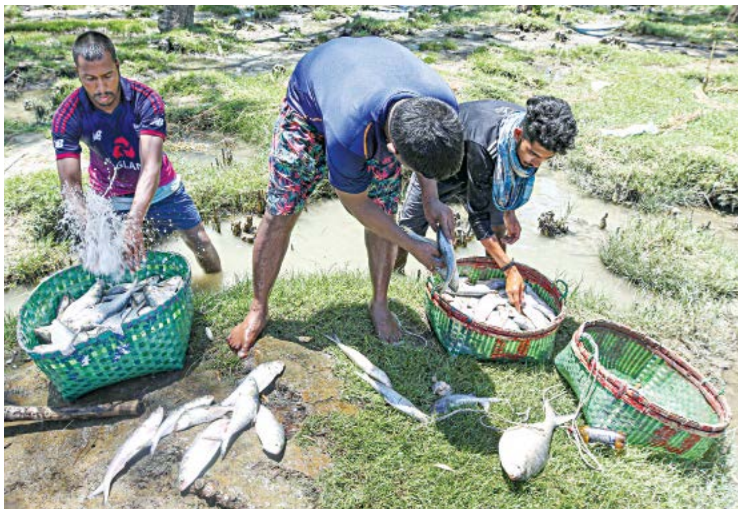
Ministry of Fisheries and Livestock imposed a 65-day ban on fishing in the Bay of Bengal between May 20 and July 23. The fishermen in Chattogram, however, continued fishing using small boats. The photo was taken in Rashmanir Ghat in Uttar Kattali of the town.