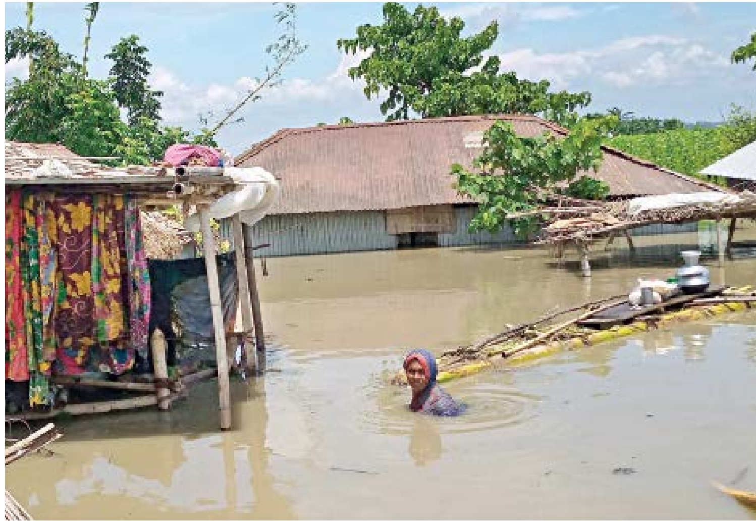
In almost neck-deep water, a woman carries dry food and kitchenware on a raft made of banana trees at Kodalkati union in Char Rajibpur upazila of Kurigram. Houses in the region remained under four-five feet of flood water as the Brahmaputra swelled up in the district. The photo was taken on Friday afternoon.