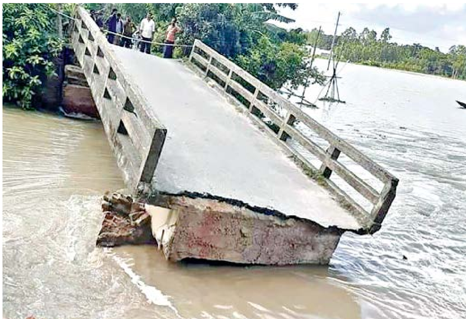
A bridge on Basail-Mirzapur road collapses due to strong currents of floodwater, snapping communications between parts of the two upazilas in Tangail. Six out of the district's 12 upazilas are hit hard by flood which has affected about 1.3 lakh people so far. The photo was taken in Basail's Kanchanpur village on Thursday.