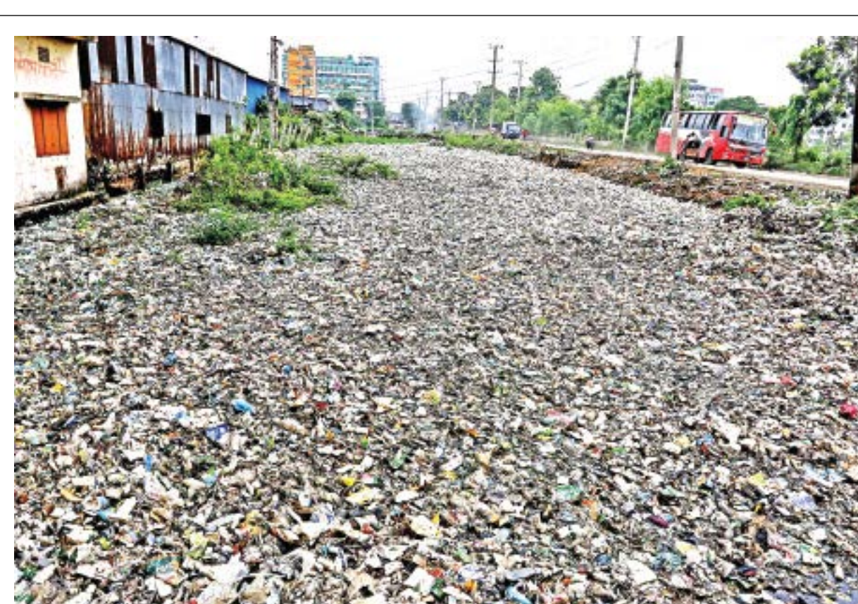
Not a drop of water remains in this canal beside the capital's Demra Staff Quarter Road. Instead, the area is filled to the brim with mountains of plastic waste. Such blatant disregard for the environment does not only pollute waterways, but impacts the lives of residents nearby as well, as they are deprived of a clean liveable city. This photo was taken recently.