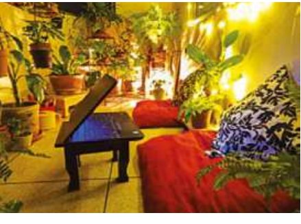
But alas! Where do we get this kind of greenery in a world full of chaos, concrete and black soot? The answer lies only 3-feet away from where we enjoy our daily meals. It stands in the balconies that each of us own, in that tiny apartment of ours, a place most of us love to call home.

Do not be disheartened if the only view that you get from your balconies are of unsightly buildings underconstruction, or something so mundane that it becomes an immediate eyesore. There's so much you can do to make the transformation inside, within the walls — that you do not need any external assistance at all, except for a little bit of sunshine to peek through every morning.