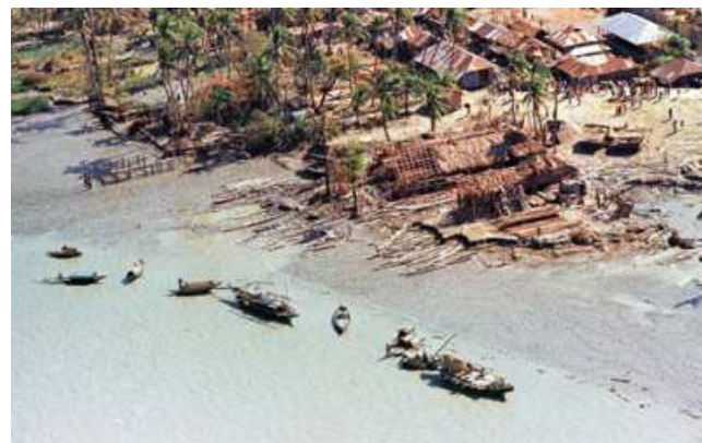
Devastation in the aftermath of the cyclone that hit the coastal region of Bangladesh, then East Pakistan, Nov. 1970. According to the World Meteorological Organization, the cyclone killed more than 300,000 people.

The author challenges the very discourse of "disaster". The disaster, viz. cyclone, hurricane, or flood, is generally perceived as "natural" and beyond "human control or responsibility". The author questions the parochial understanding of disaster and asserts that disaster is not merely "natural", but deeply interrelated with human actions.