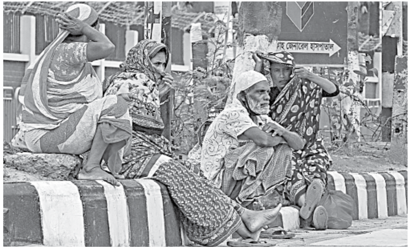
The poor in Bangladesh are still waiting for cash assistance.

The failure to administer the cash transfer programme quickly and efficiently is symptomatic of the mismanagement of the government. Lack of coordination, from testing to economic stimulus packages, is easily discernible. Instead of trying to address the rampant corruption and reign in the party activists and loyalists within the administration, the government's actions have slowed down the programme itself. Most importantly, it has revealed the priorities of the government—poorer segments are the least of its concerns. The public health system has already failed to serve the citizens, particularly the less fortunate, while the elite and so-called VIPs are