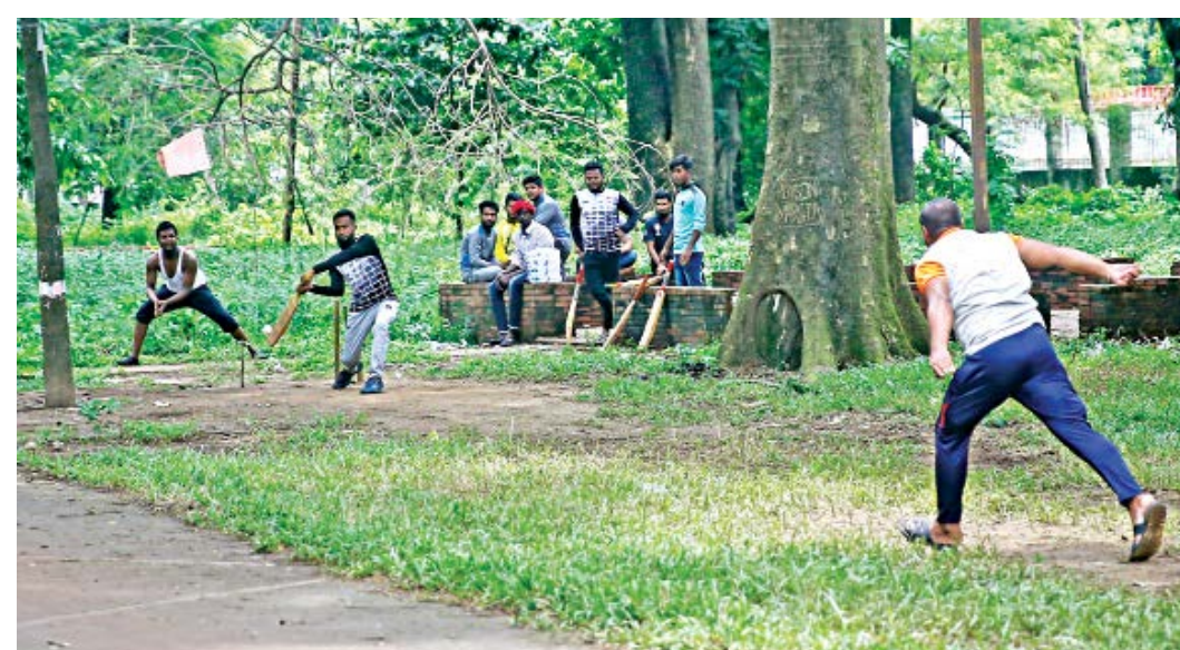
Professional cricket may still be sometime away from a return in Bangladesh, but cricket as a means of leisurely recreation has already made it to the parks -- like this one at the Suhrawardy Udyan -- and alleys and terraces despite the scourge of Covid-19.

The victory, followed by a draw for second-placed Benfica at Famalicao later on Thursday, means Porto need one more point to guarantee winning the league given their head-to-head record.