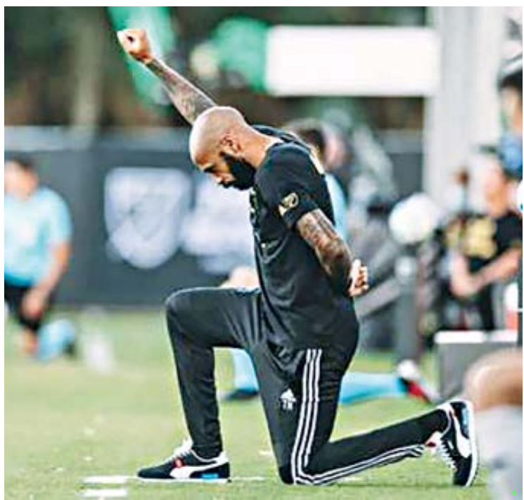
Montreal Impact manager Thierry Henry took a knee for eight minutes and 46 seconds at the start of their Major League Soccer game against New England on Thursday.

Impact lost 1-0 in Thursday's game, their opener in the "MLS is Back" tournament.