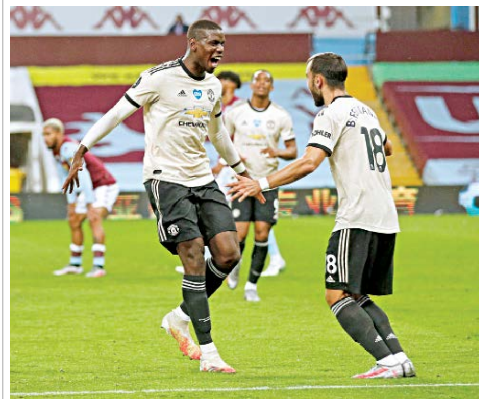
Paul Pogba (L), Bruno Fernandes (R) and Mason Greenwood got their names on the scoresheet as Manchester United thrashed Aston Villa 3-0 on Thursday, becoming the first team in Premier League history to win four consecutive games by at least a three-goal margin and extending their unbeaten streak to 16.

The situation in Lisbon itself is particularly concerning, with lockdown restrictions reimposed last week on 19 neighbourhoods across the northern periphery of the city as virus cases increase at a worrying rate.