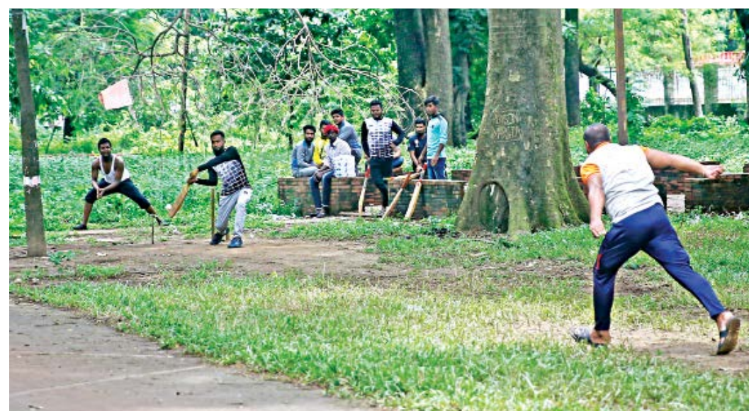
Professional cricket may still be sometime away from a return in Bangladesh, but cricket as a means of leisurely recreation has already made it to the parks -- like this one at the Suhrawardy Udyan -- and alleys and terraces despite the scourge of Covid-19.

The victory, followed by a draw for second-placed Benfica at Famalicao later on Thursday, means Porto need one more point to guarantee winning the league given their head-to-head record.