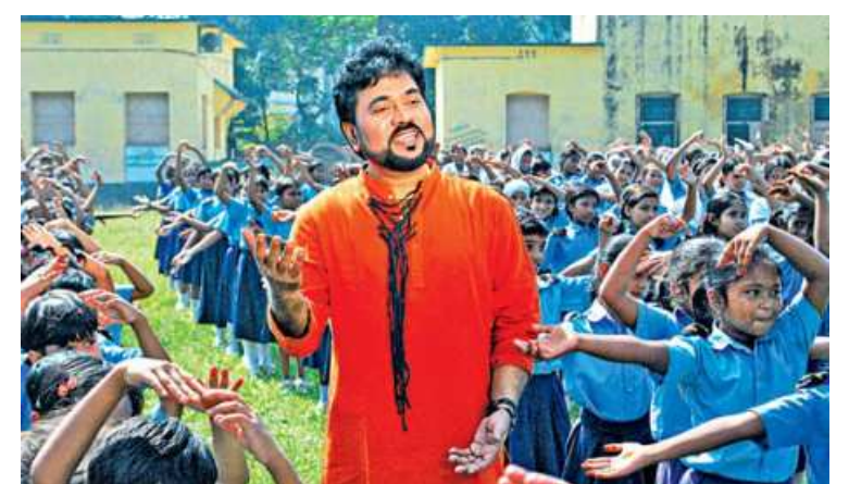
Andrew Kishore shooting a song on 'Ityadi'.