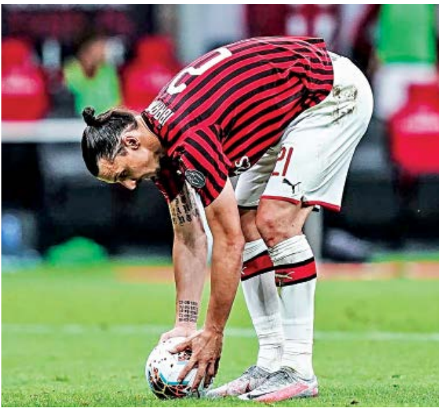
The clash between Milan and Juventus at San Siro started on a sombre note, with tribute paid to the late music composer Ennio Morricone. The game ended on a sombre note for the Bianconeri, who despite taking a 2-0 lead including one goal from Cristiano Ronaldo, were subject to a 4-2 defeat by the Rossoneri, orchestrated by Zlatan Ibrahimovic.