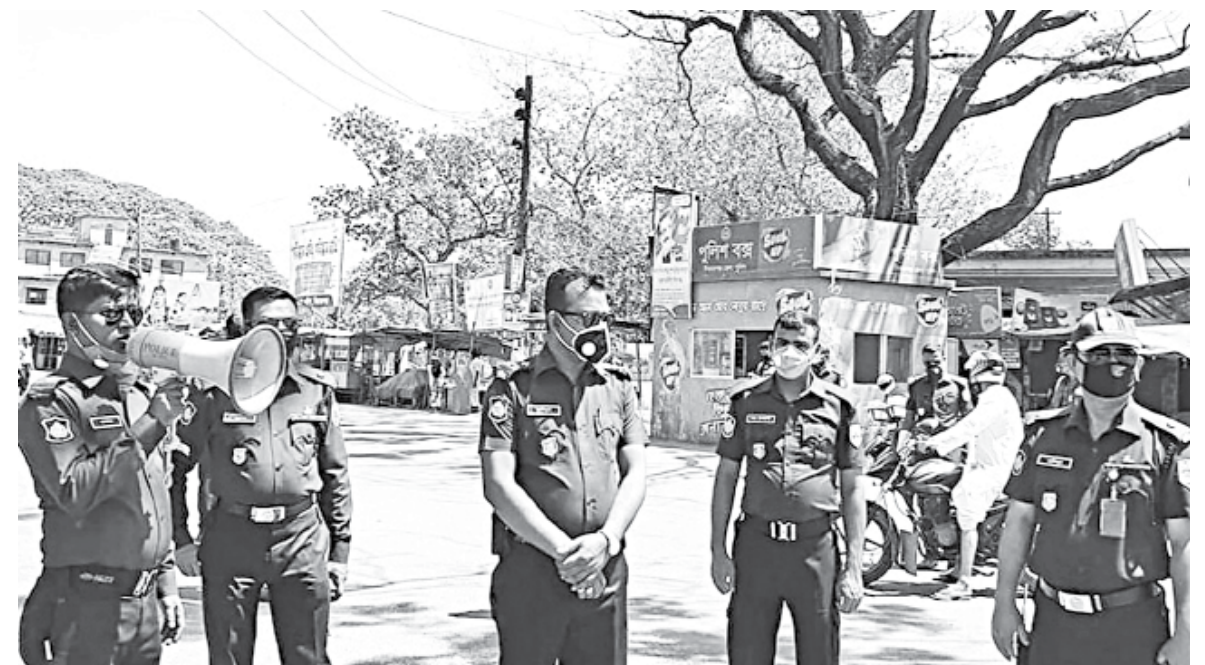
Police officers wearing face masks patrol the Bazar Station Road area of Sirajganj Sadar Upazila.

sensitive, who are agents of assistance rather than control, accountable not just for what they do but how they do it, and are no longer the unthinking, unquestioning functionaries responsible only to their seniors. The move toward this new code of ethics