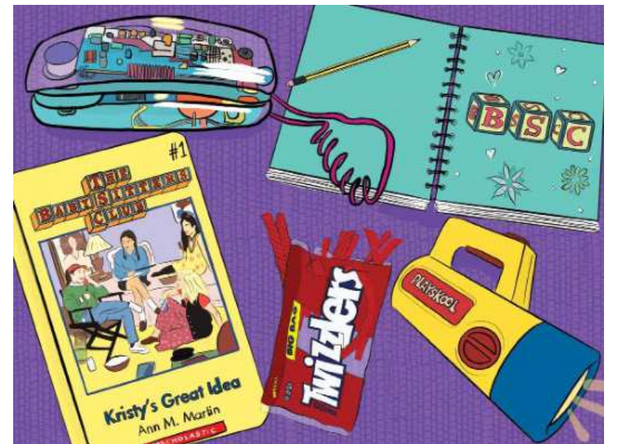
ILLUSTRATION: ABRESHMI ANIKA CHOWDHURY / @ABRUSHMI

Netflix's adaptation of The Baby-Sitters Club , released on July 3, pulls off the tricky feat of setting this story in 2020, while staying true to all that avid fans loved about the book series. Much like the books, each instalment of the show revolves around and is narrated by a particular character. This lets each of the girls flesh out their individual stories and relationships. Small details from the analogue days enrich this adaptation—the baby-sitters still use