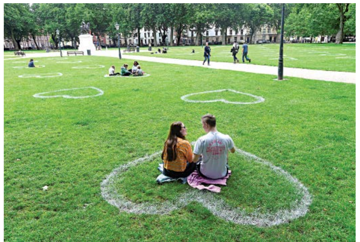
Hearts painted by a team of artists from Upfest are seen in the grass at Queen Square, following the coronavirus disease (COVID-19) outbreak, in Bristol, Britain yesterday.

Tharoor tweeted: "One has to doubt the motives of those who selected the topics to drop. Have they decided democracy, diversity, secularism and 'the like are more dispensable concepts for tomorrow's Indian citizens?'"