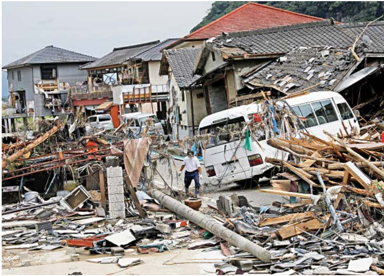
A man looks for his belongings at his damaged house after floods caused by torrential rain, in Kumamura, Kumamoto Prefecture, southwestern Japan, yesterday. Torrential rain pounded central Japan yesterday as authorities said 61 people were feared dead in days of heavy downpours that have triggered devastating landslides and terrifying floods.