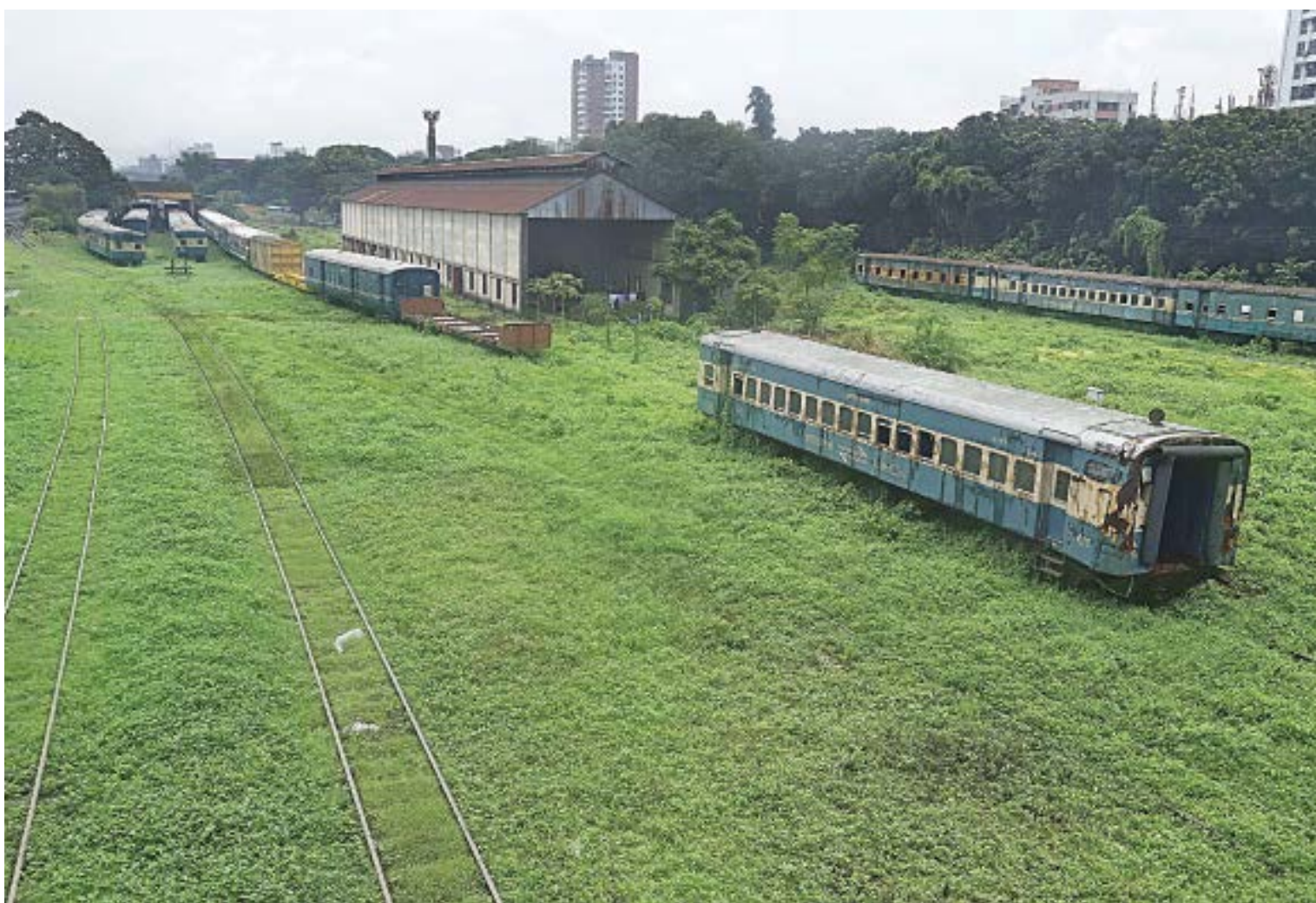
A lush vegetation appears to be reclaiming the stabling area at Kamalapur rail station in the capital. With a fraction of the fleet of trains operating after over two months of shutdown, the pre-pandemic hustle and bustle has yet to return to the terminal. The photo was taken yesterday.