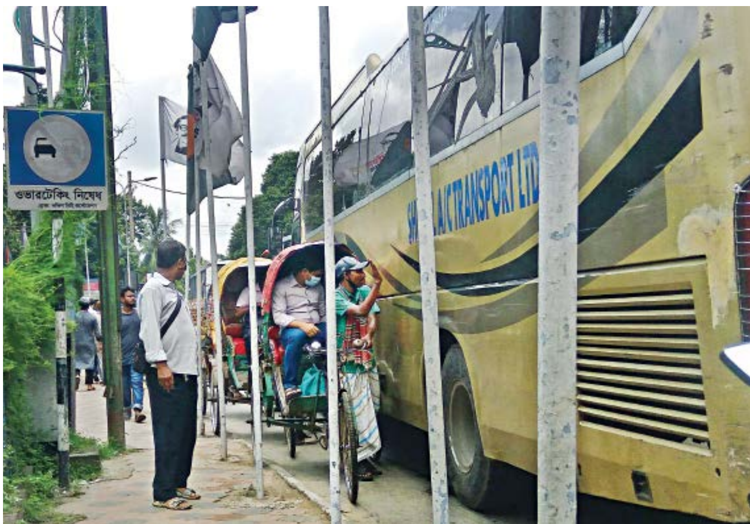
Rickshaws going against traffic in front of the Bangabhaban during the busy morning hour yesterday. One would think that the most basic traffic rule is enforced at least around the presidential palace.