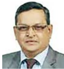
ASM SHAYKHUL ISLAM

The whole mankind of this planet is now living in a completely unknown socioeconomic environment amid the Covid-19 pandemic.