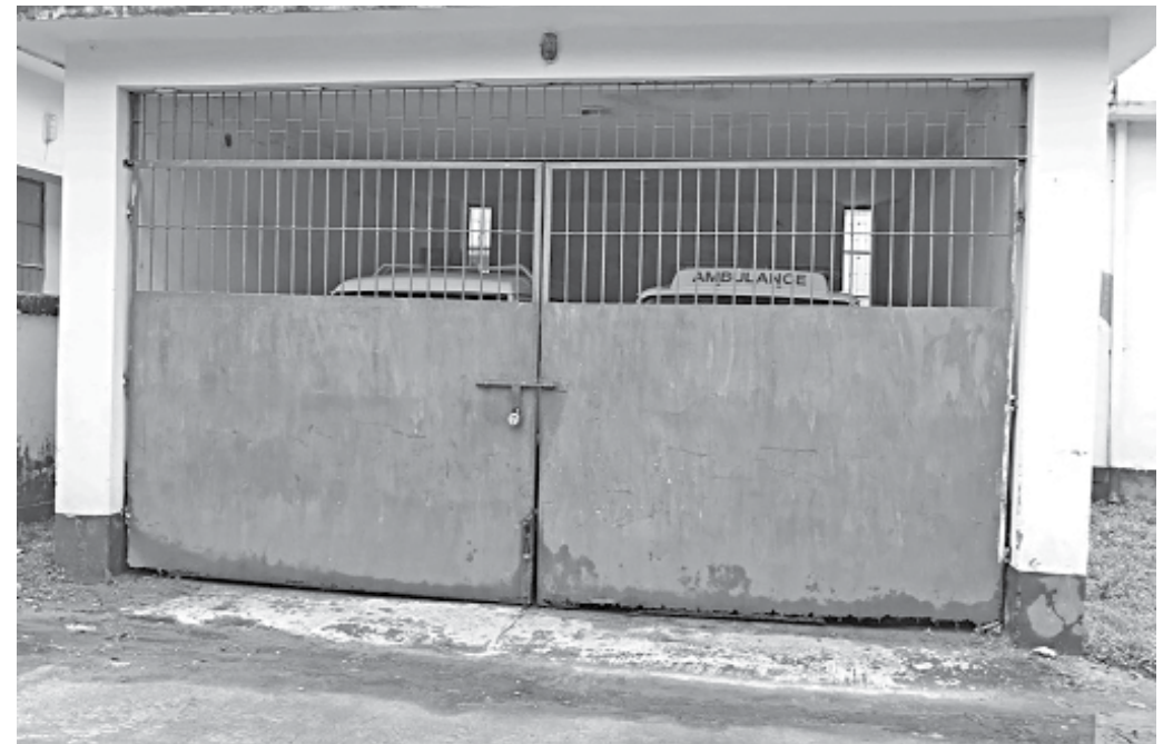
Patients at Pirojpur District Hospital suffer as the ambulance drivers sued for murder of two persons are on the run. Two ambulances are parked in the garage of the hospital.

But on the way to KMCH, ambulance driver Kabir took the victim to a house in Pirojpur town where a group of fake doctors, led by Sachin Roy, a pharmacist of Pirojpur District Hospital,