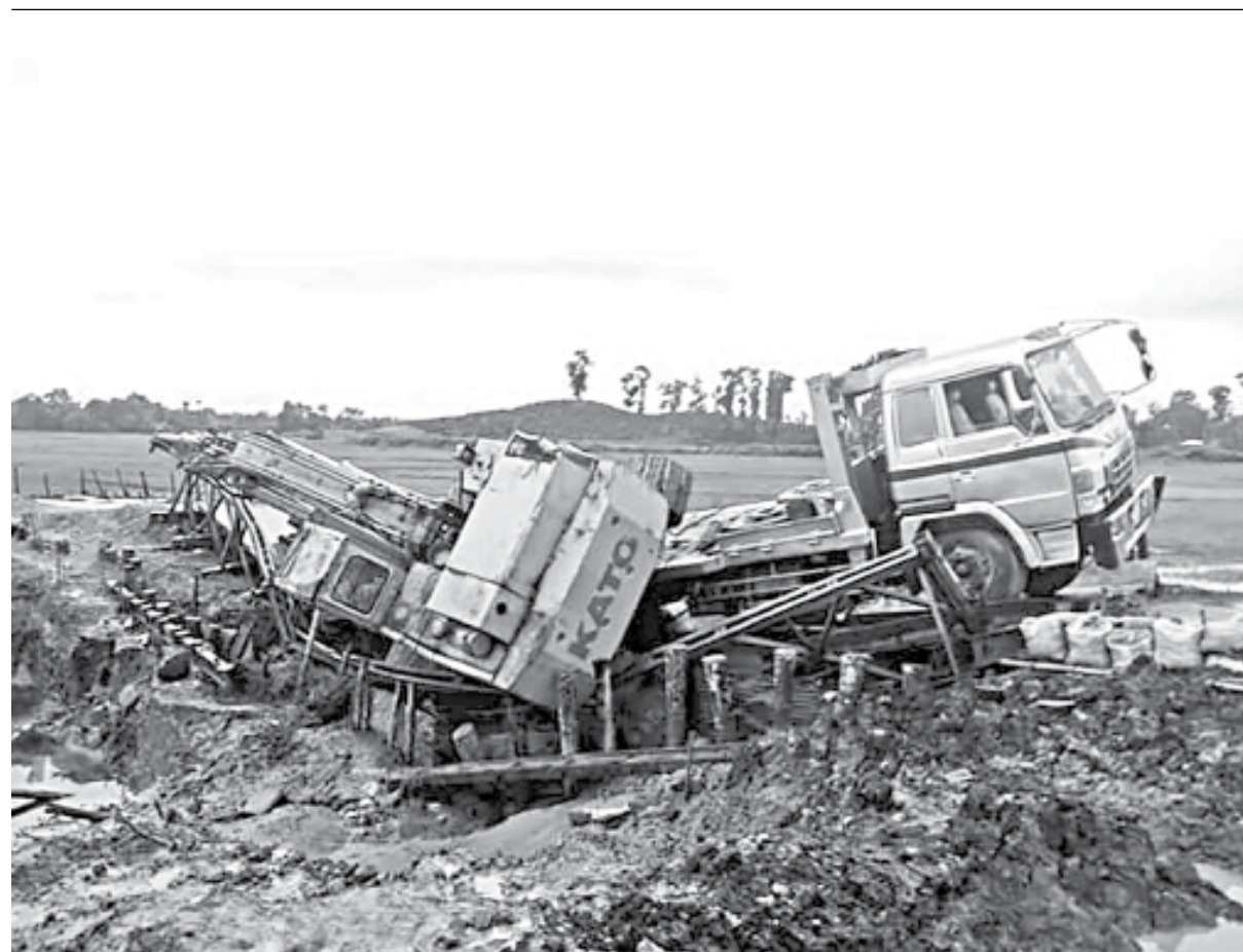
Road communication between Fultola and the upazila headquarter remains suspended since Friday morning after an under construction Bailey bridge on a diversion road collapsed at Kapnapahar in Moulvibazar's Juri upazila.

However, an ambulance driver from an upazila health complex in Barguna district joined Pirojpur District Hospital yesterday, said the civil surgeon.