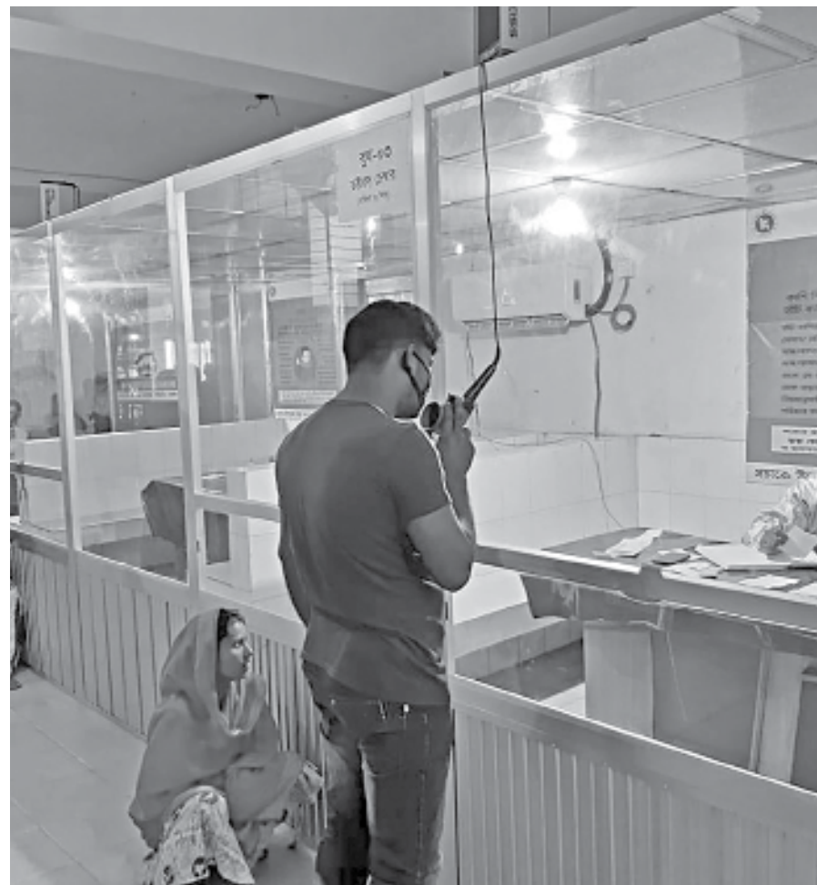
Doctors and health workers provide services for outdoor patients from inside a four-booth safety chamber at Kalihati Upazila Health Complex in Tangail, maintaining safety measures for all concerned against coronavirus infection.