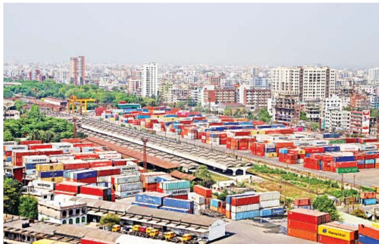
SK ENAMUL HQ

First, it is because of the widespread shutdown of the factories in China in February and March and mass spread