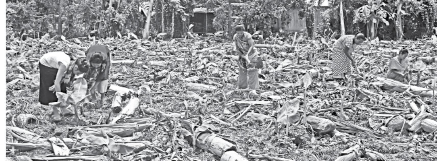
The hands, that once held delicate make-up brushes in air-conditioned parlours, now digs through the hard earth with axes

She said her parlour owner contacted her recently and told her to look for work