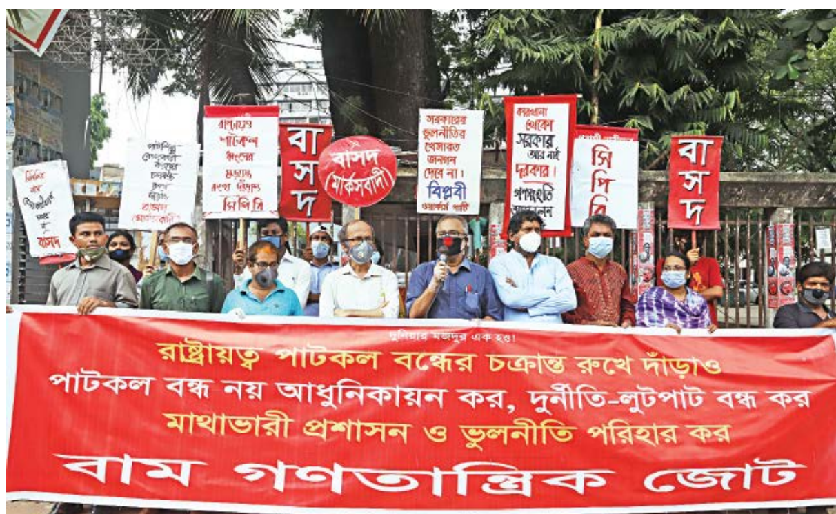
Leaders of Left Democratic Alliance, a coalition of left-leaning political parties, formed a human chain in front of the capital's Jatiya Press Club yesterday, protesting the "conspiracy to shut down" state-owned jute mills across the country.