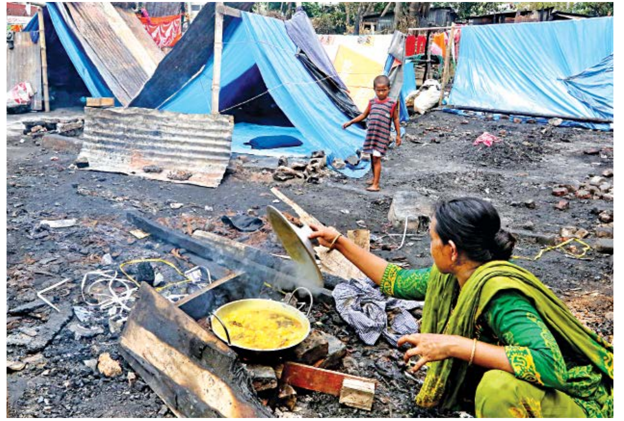
Residents of Kamalapur TT Para slum were already spending difficult days, as many of them had lost their jobs during the pandemic. In a cruel twist of fate, many of them lost their last belongings when at least 30 shanties of the slum were gutted in a blaze on Saturday. The hapless dwellers have been living under the open sky since, as they have received little to no aid to cover their losses. The photo was taken yesterday.