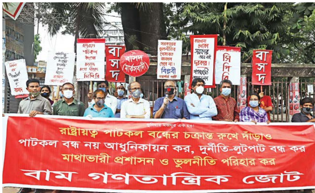
Leaders of Left Democratic Alliance, a coalition of left-leaning political parties, formed a human chain in front of the capital's Jatiya Press Club yesterday, protesting the "conspiracy to shut down" state-owned jute mills across the country.