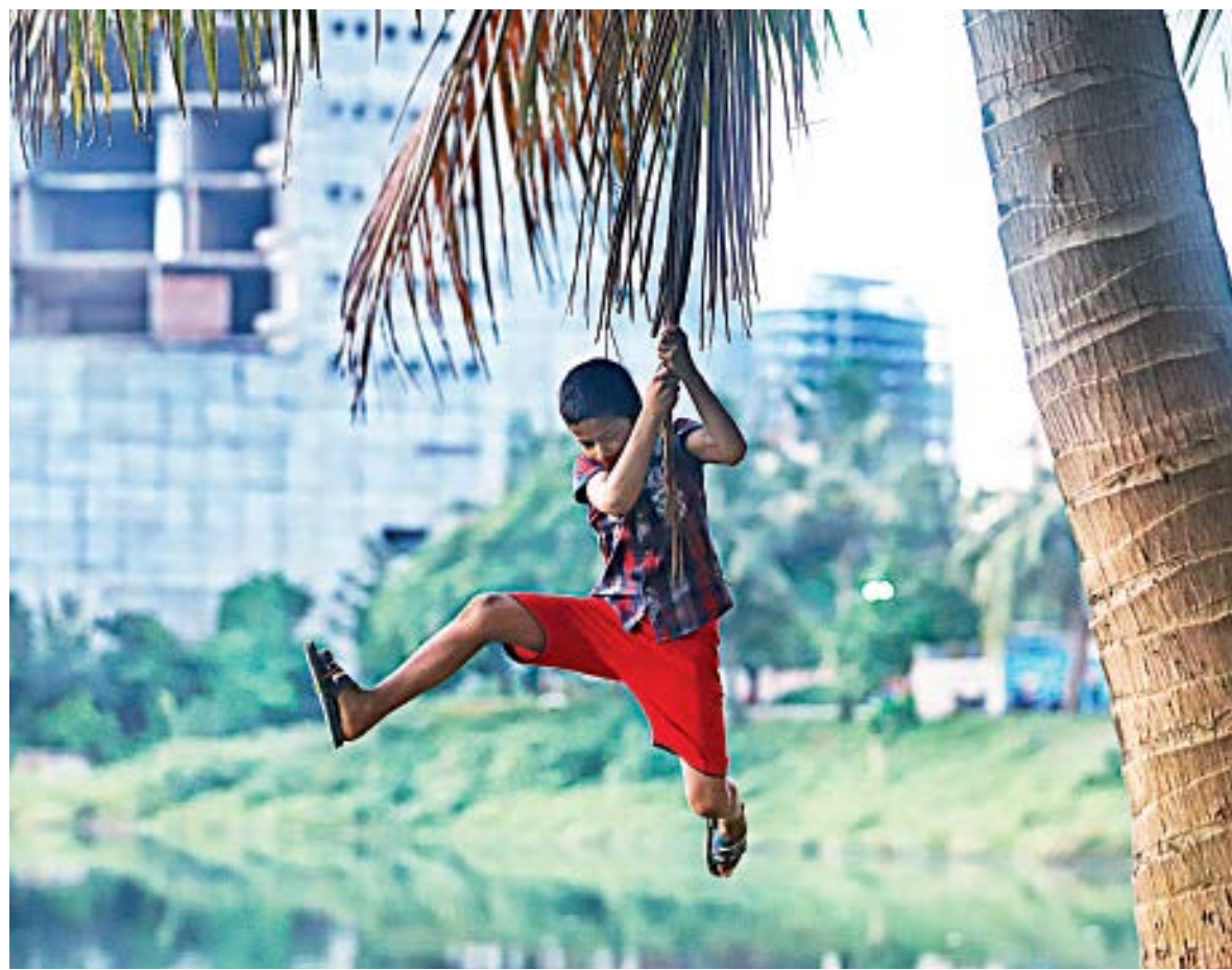
URBAN TARZAN... After being stuck at home for months, this boy finally got a chance to go out for some time under the strict supervision of his guardians over the weekend. And he made the best out of every single moment by either swinging from a tree branch or running around in Hatirjheel.