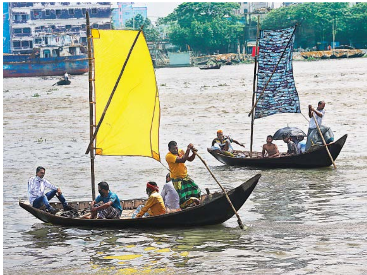
BACK IN BUSINESS... With the wind on their side, boatmen row these makeshift sailboats on the Buriganga to ferry people from Dhaka to Keraniganj yesterday. Since movement restriction has been eased, these out-of-work boatmen have started to ply their trade on the river, ferrying people from one side to the other for Tk 10.