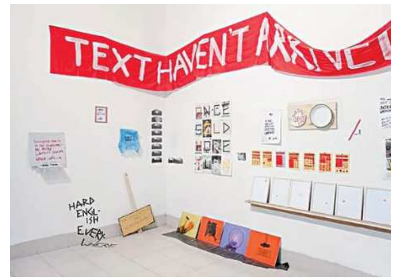
Abir Shome's 'Capital-Equal'.