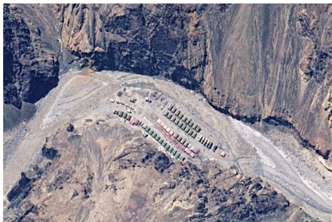
Maxar WorldView-3 satellite image taken on May 22 shows the PLA (China's People's Liberation Army) Base in Galwan Valley.

Both sides agreed this week to 'disengage' in contested areas