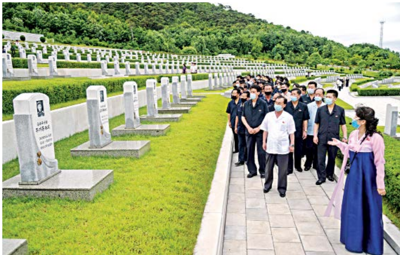
People walk between graves as they visit the Fatherland Liberation War Martyrs Cemetery on the 70th anniversary of the start of the Korean War in Pyongyang, yesterday. North and South Korea separately marked the 70th anniversary of the war that killed millions of people. Communist North Korea invaded the US-backed South on June 25, 1950, as it sought to reunify by force the peninsula Moscow and Washington had divided at the end of the Second World War. The fighting ended with an armistice that was never replaced by a peace treaty, leaving the peninsula and millions of families split by the Demilitarized Zone.