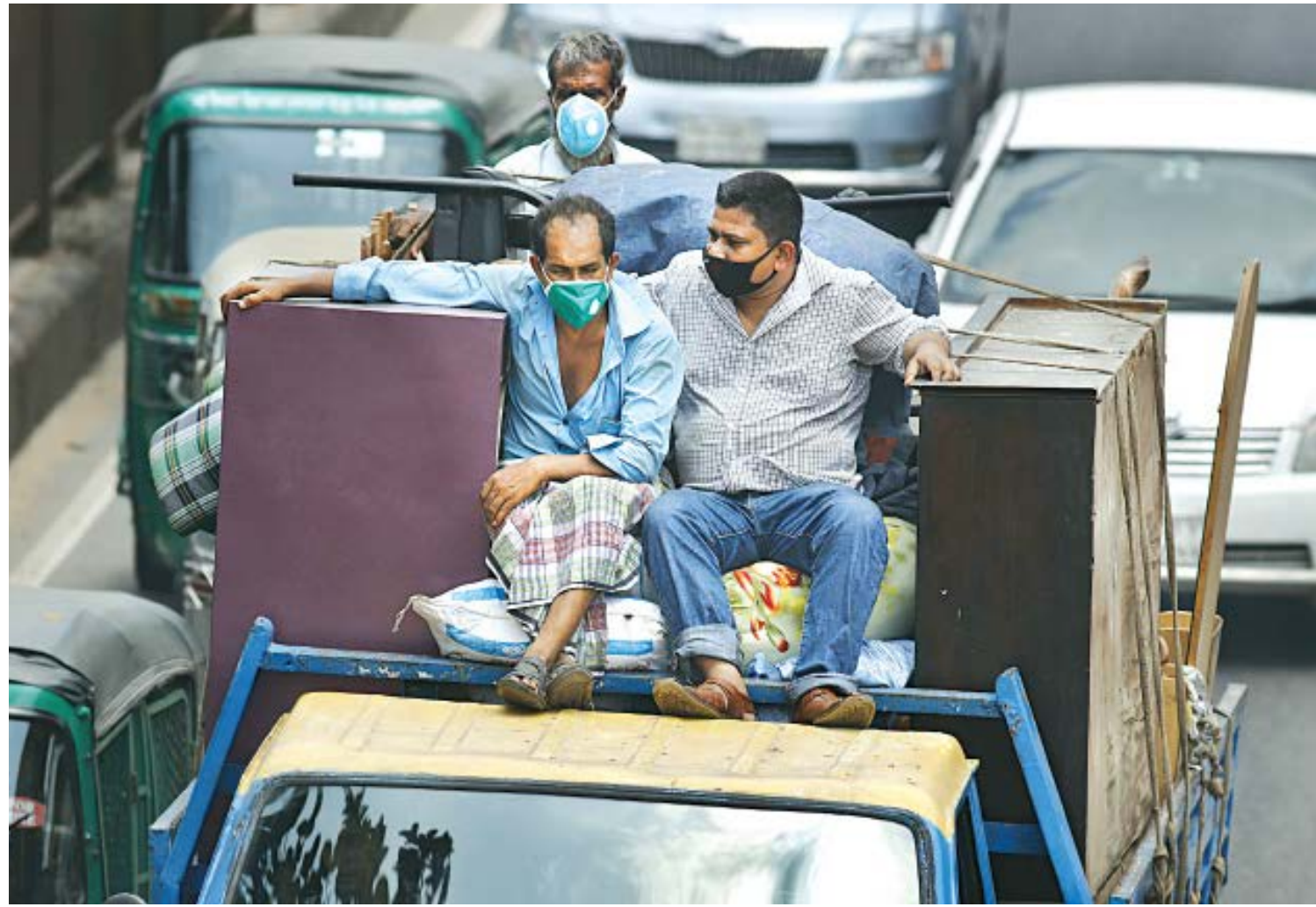
Two men sitting atop the furniture and luggage being carried on a truck. Middle- and lower-income families leaving the capital has become a common sight lately, as the financial fallout from the Covid-19 outbreak and shutdown has made it impossible for many to cover living expenses. The photo was taken in Gabtoli area yesterday.