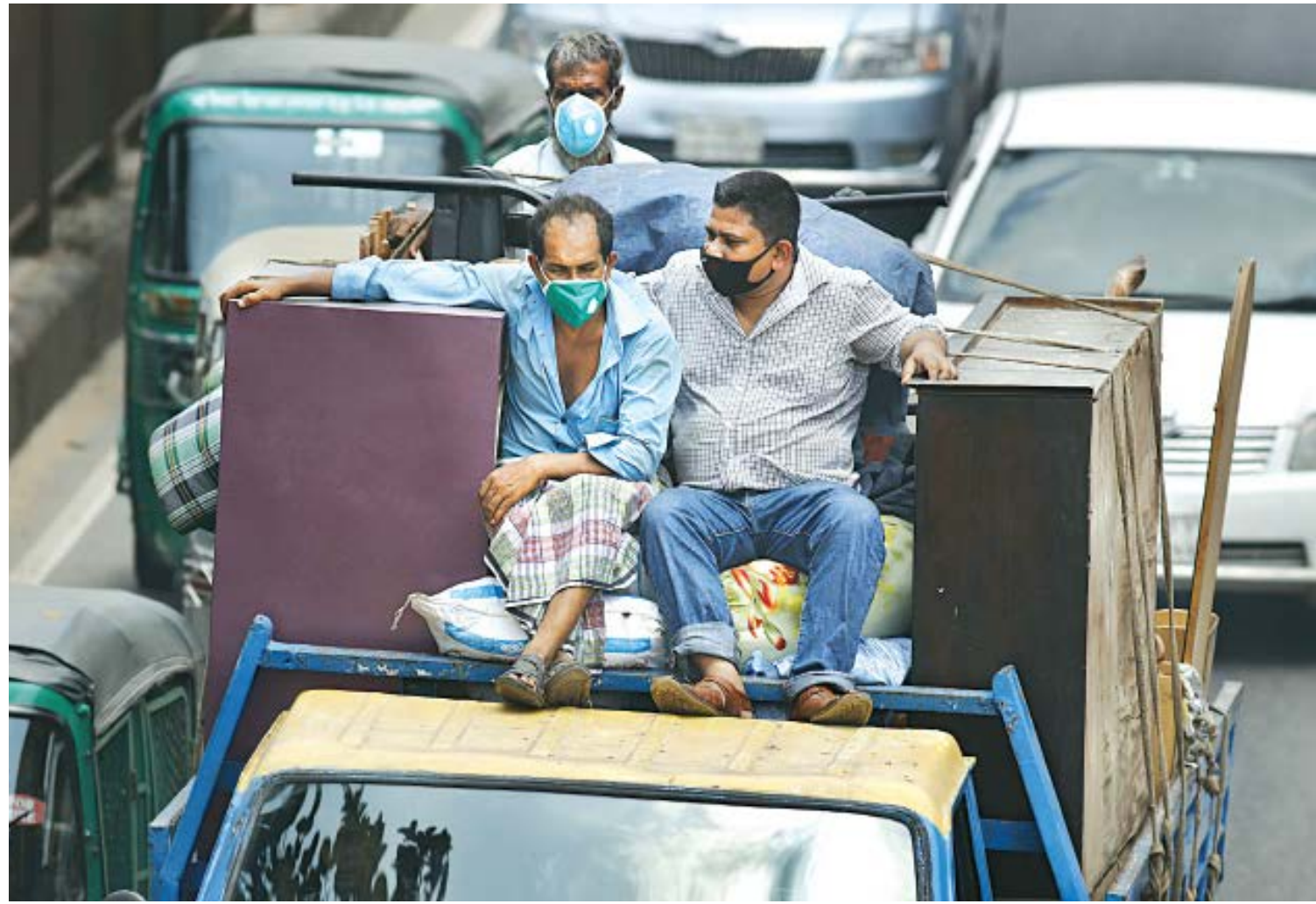
Two men sitting atop the furniture and luggage being carried on a truck. Middle- and lower-income families leaving the capital has become a common sight lately, as the financial fallout from the Covid-19 outbreak and shutdown has made it impossible for many to cover living expenses. The photo was taken in Gabtoli area yesterday.