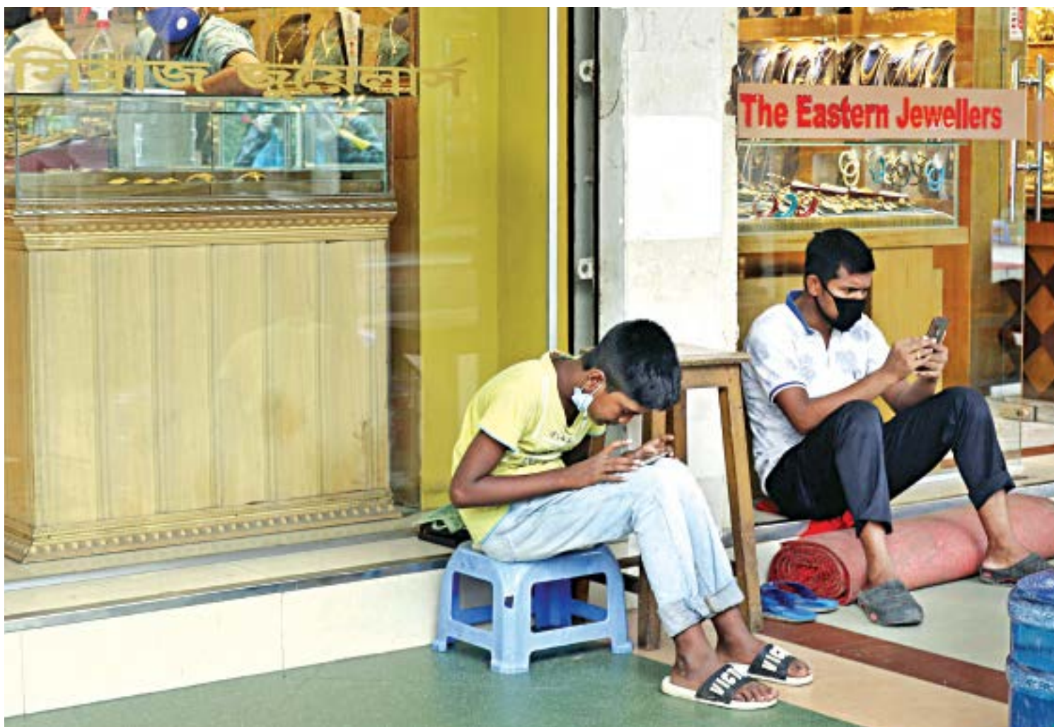
Staffers of a jewellers' in New Market sitting outside the shop, idling away time. Even though the shutdown for Covid-19 was partially withdrawn nearly three weeks ago, large businesses and shops are yet to see the usual turnout of customers.