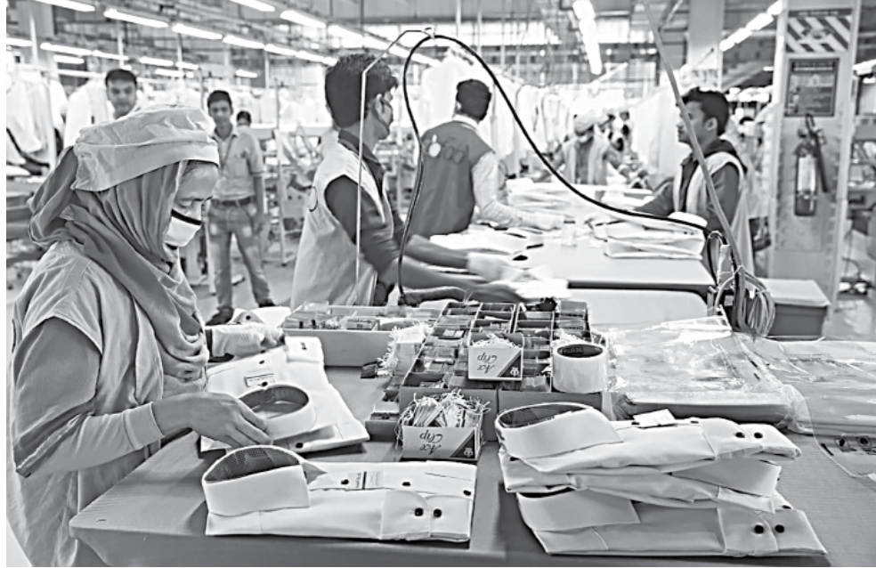
The widespread perception that robots will automate everything in the RMG industry and take over jobs is questionable.

To get an idea of how automation impacts garments manufacturing, consider the initial stage—“pattern design”. Before automation,