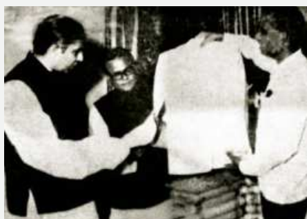
A scientist of the Bangladesh Council of Scientific and Industrial Research presents a newly-invented jute-made clothing product 'juton' to Bangabandhu on June 22, 1972.