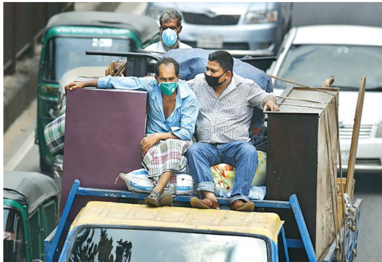
Two men sitting atop the furniture and luggage being carried on a truck. Middle- and lower-income families leaving the capital has become a common sight lately, as the financial fallout from the Covid-19 outbreak and shutdown has made it impossible for many to cover living expenses. The photo was taken in Gabtoli area yesterday.