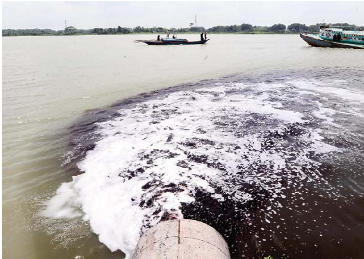
Apparently untreated effluent from tanneries at Savar Tannery Industrial Estate flows into the Dhaleshwari river. The estate has been using its central effluent treatment plant on trial for almost two years and is yet to put it into regular service. The photo was taken in Savar's Hemayetpur area yesterday.