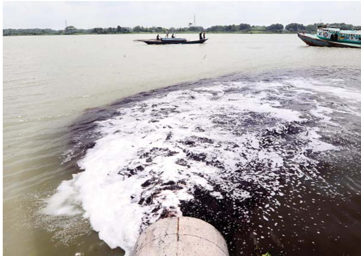
Apparently untreated effluent from tanneries at Savar Tannery Industrial Estate flows into the Dhaleshwari river. The estate has been using its central effluent treatment plant on trial for almost two years and is yet to put it into regular service. The photo was taken in Savar's Hemayetpur area yesterday.