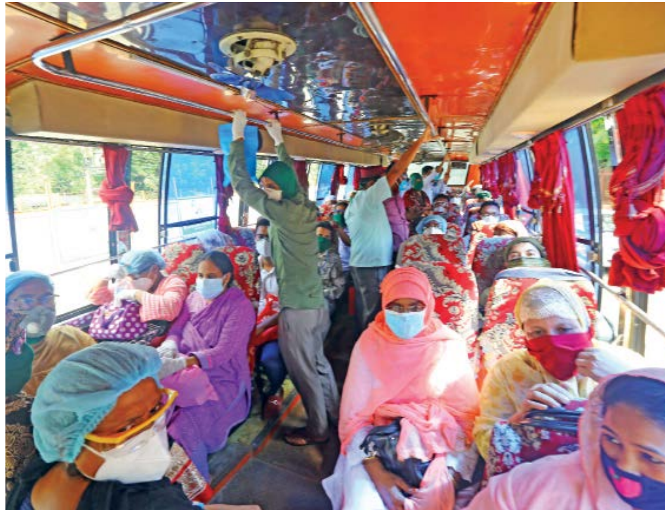
Staffers of the capital's Birdem hospital yesterday going home after work in a bus designated for them. Public buses are only allowed to carry passengers at half capacity to maintain social distancing directives. In this case, it has been ignored.