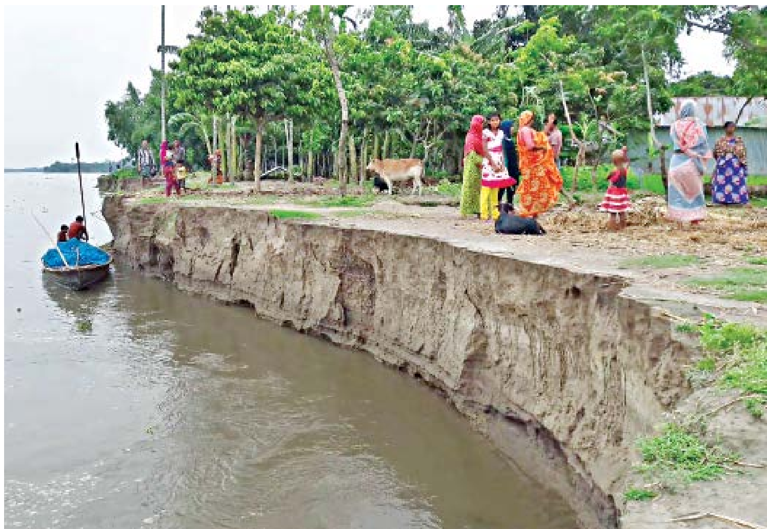
Villagers look on as the mighty Dharla river devours their land in Kulur area of Lalmonirhat Sadar upazila yesterday. The river has been eating their land for the last three days as the flood water receded. Every year hundreds of families lose their homes and livelihoods to such river erosion.