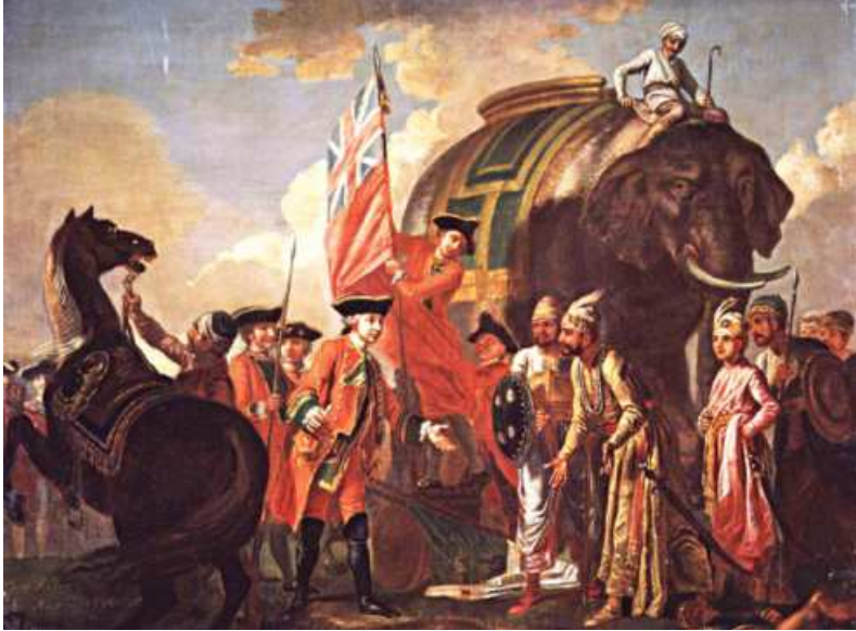
Robert Clive and Mir Jafar after the Battle of Plassey, in a painting by Francis Hayman, 1760.