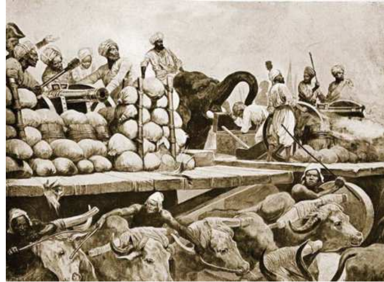
The Nawab's artillery on movable platform.