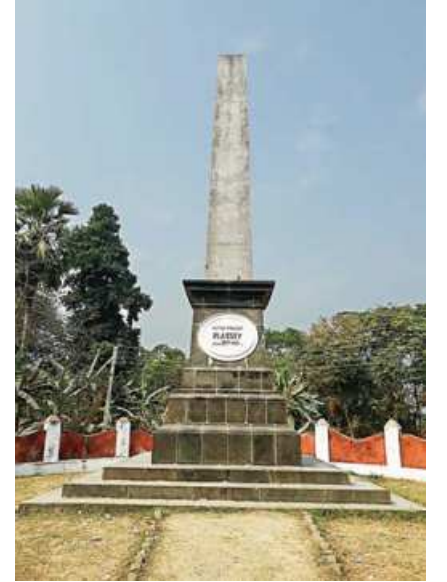
Plassey Monument at the battlefield of Plassey.