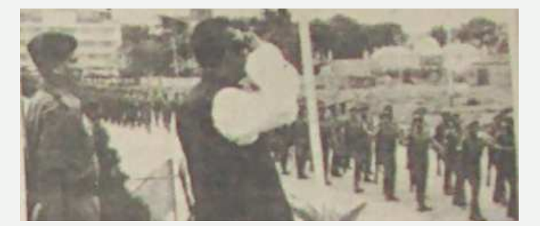
June 21, 1972.