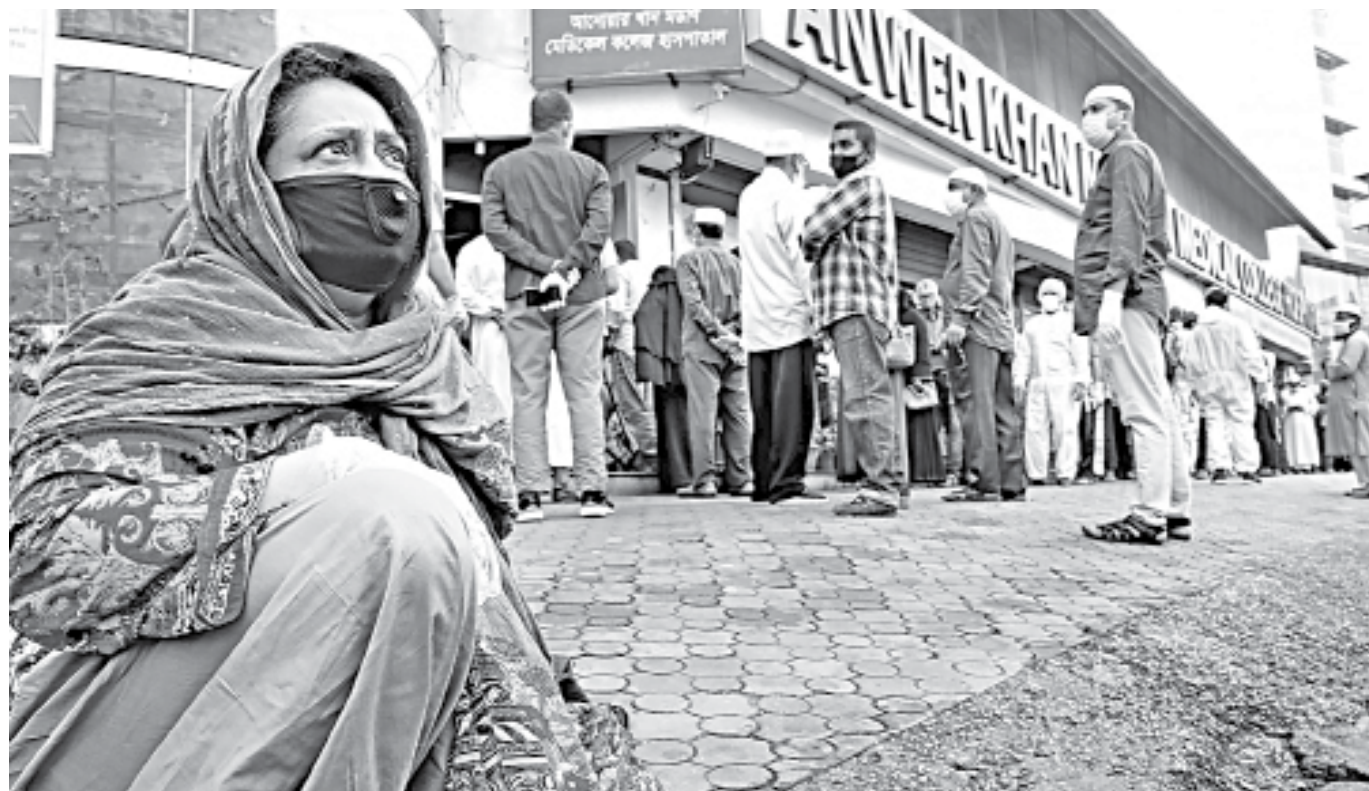
Doctors aren’t turning people away because they are cold-hearted or incapable. They simply don’t have the resources they need to care for patients, or even to protect themselves.

Instead of listening to health workers and addressing their concerns, the authorities have cracked down on those who speak out, including with the draconian Digital Security Act, and issued blanket gag orders to doctors and nurses.