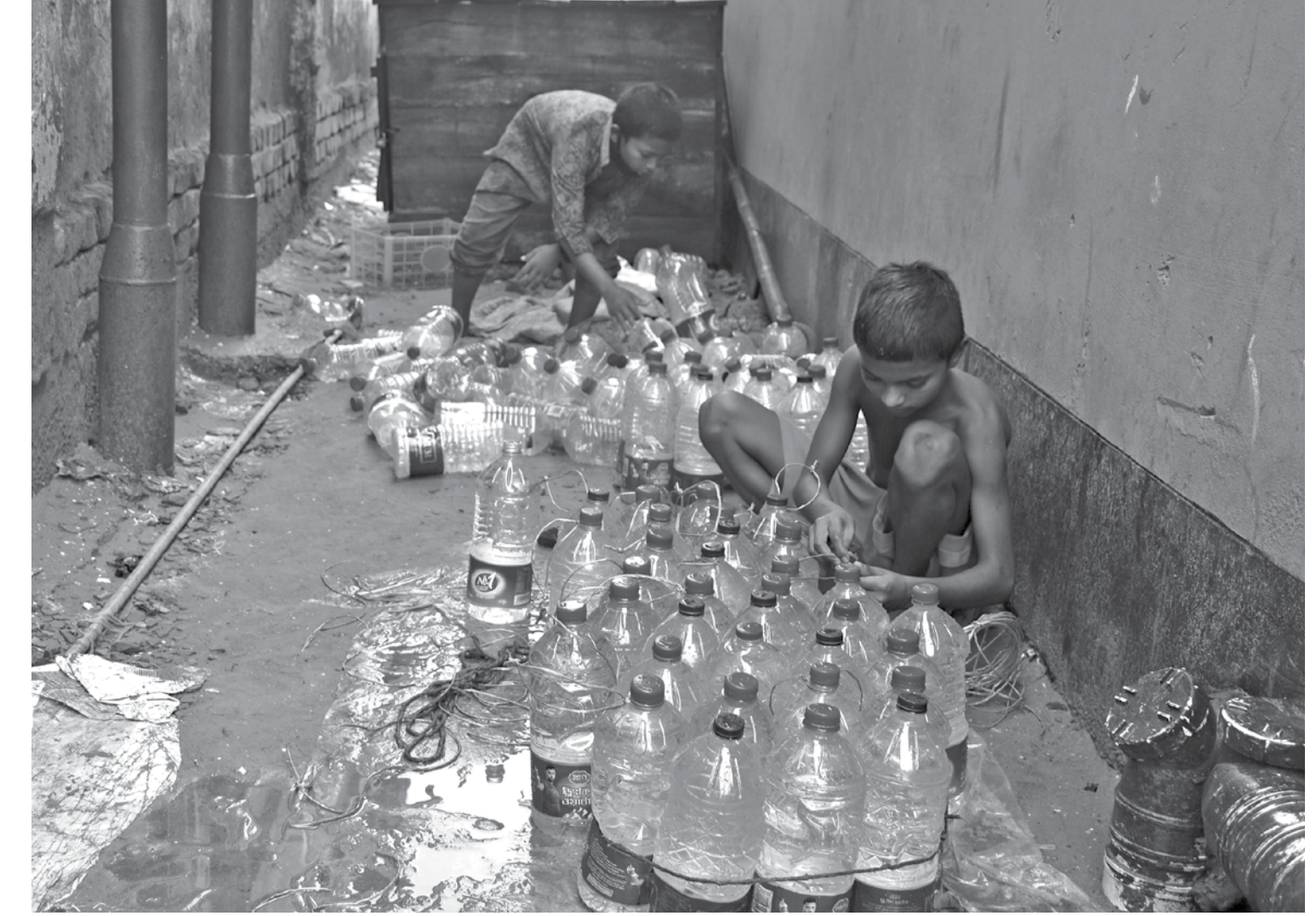
Street children collect empty water bottles left by passengers at the waterways launch terminal, fill them with water tapwater, and resell them to outgoing passengers for Tk 10 per bottle. The photo was taken from Barishal River Port area last week.

"Through various efforts, Care Bangladesh reached to 1,723,958 people in different parts of Bangladesh till last month," he added.