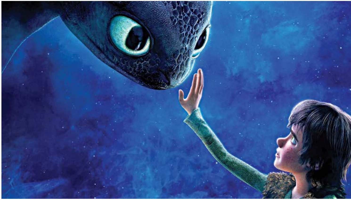
How to Train your Dragon