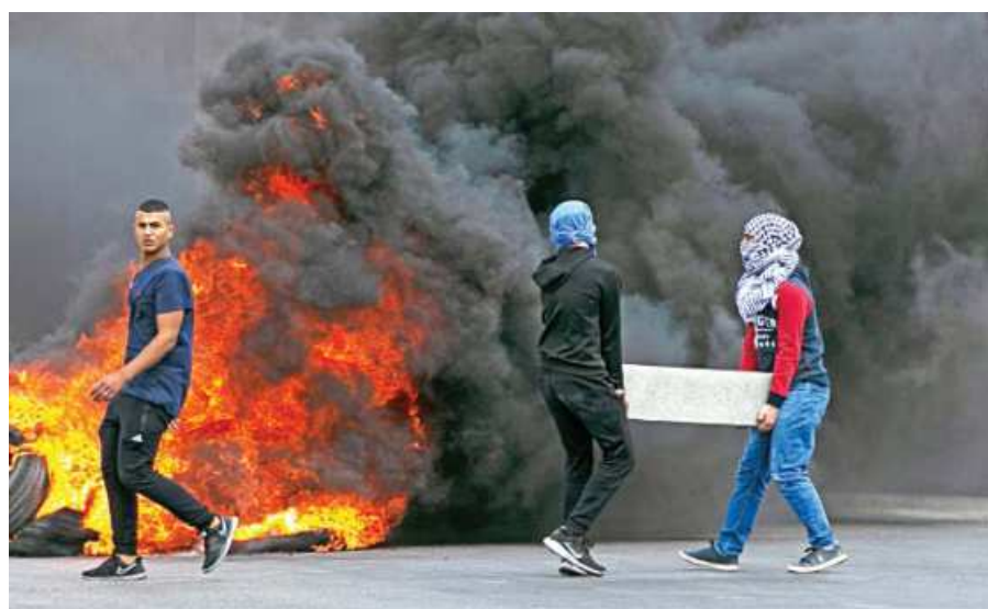
Palestinian demonstrators carry a cement block and burn tires as they clash with Israeli troops during a protest against Israel's plan to annex parts of the occupied West Bank, near the city of Ramallah, yesterday. Israel intends to annex West Bank settlements and the Jordan Valley, as proposed by US President Donald Trump, with initial steps slated to begin from July 1.