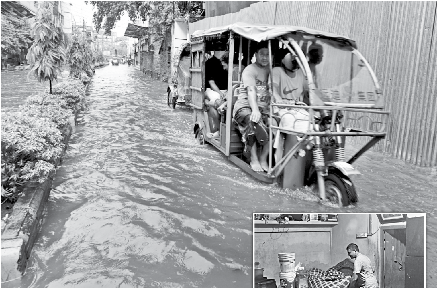
Narayanganj city's Deobhog area was severely waterlogged after it started raining heavily since yesterday morning. This newly built road overflowed with muddy water because proper drainage might not have been taken into account during construction. Inset, a man desperately tries his best to save everything from the water pouring into his house, and many others had to do the same.