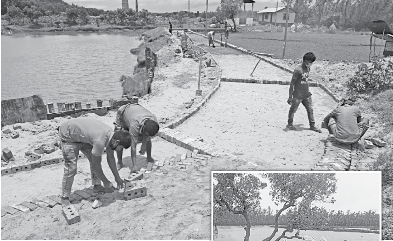
This cremation site at Chattogram city's Kattali, which gets frequently overflowed with seawater, is being renovated so the deceased can be put to rest properly. The site was designated for those who died from Covid-19, but earlier, volunteers had to move bodies while traversing knee-deep water, inset. The photo was taken yesterday.