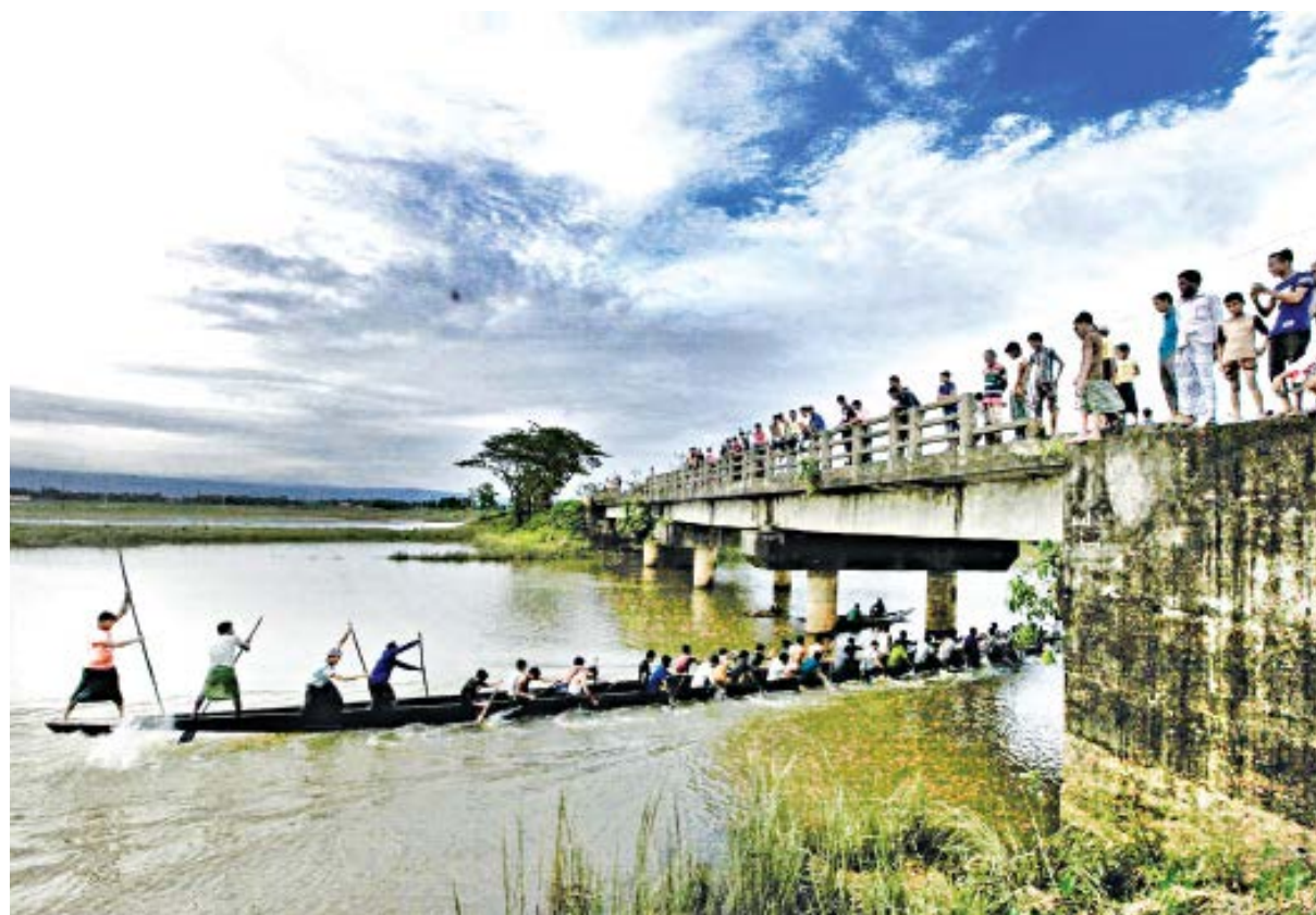
People practicing for the upcoming boat race in the Damri river of Sylhet's Jaintapur while locals look on from a bridge. The race is held every year when the river is full of water in the rainy season. The photo was taken recently.