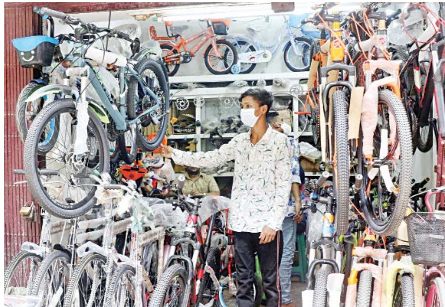
A young man choosing a bicycle at a shop in the capital's Bongshal area. Traders there have seen a sharp rise in their daily sales after the shutdown was withdrawn. They say people are opting for bicycle ride as transport fares have increased and public transport is being avoided in fear of coronavirus infections. The photo was taken yesterday.