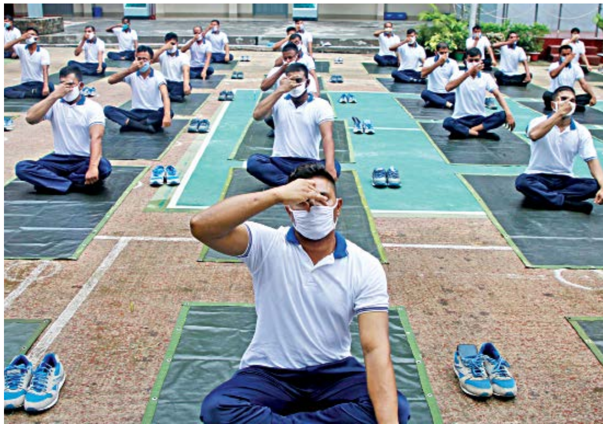
STAYING FIT FOR DUTY... Diplomatic Security Division of Dhaka Metropolitan Police is organising yoga sessions three times a week for its members at their office in Gulshan, in a bid to boost the immunity of law enforcers working amid the coronavirus outbreak.