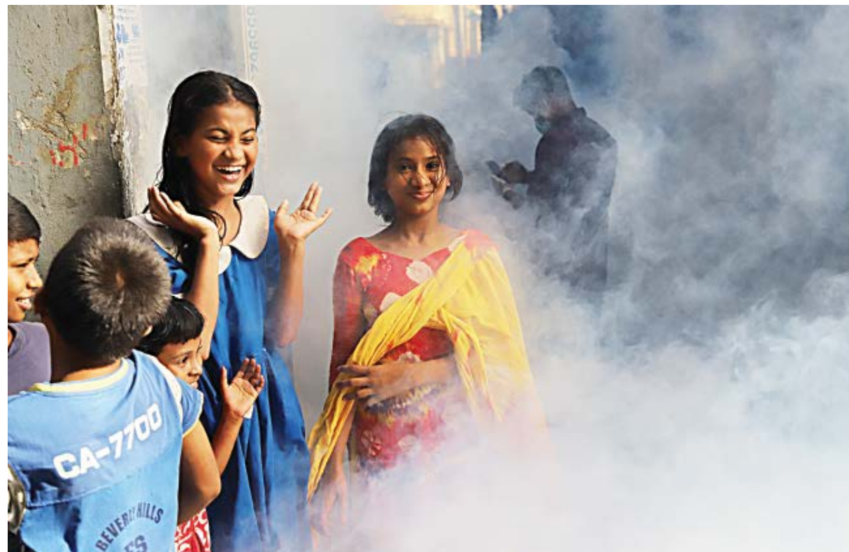
A group of children appear to be amused by smoke being dissipated by fogger machines of Dhaka South City Corporation, as part of its anti-mosquito drives. With the advent of monsoon, the mosquito population is also feared to rise, and authorities are putting in extra efforts to curb the menace. The photo was taken yesterday in the capital's Muga.