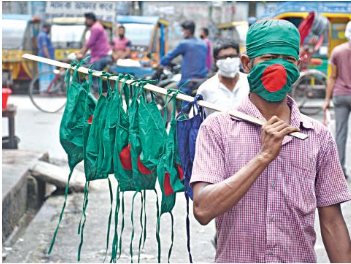
As the world learns to live with the threat of a virus infection, customised masks were just a matter of time. This vendor in Barishal's Nazir Mahalla road was spotted selling masks and headcaps fashioned after the national flag yesterday. The WHO recommends wearing masks to contain the spread of coronavirus, even if they are made of plain fabric.