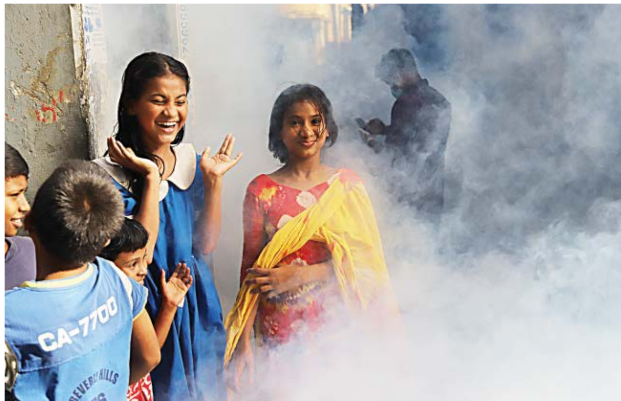
A group of children appear to be amused by smoke being dissipated by fogger machines of Dhaka South City Corporation, as part of its anti-mosquito drives. With the advent of monsoon, the mosquito population is also feared to rise, and authorities are putting in extra efforts to curb the menace. The photo was taken yesterday in the capital's Muga.