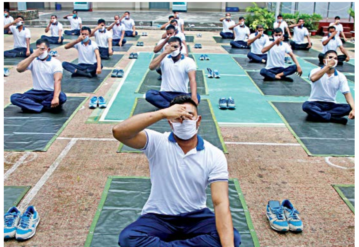
STAYING FIT FOR DUTY... Diplomatic Security Division of Dhaka Metropolitan Police is organising yoga sessions three times a week for its members at their office in Gulshan, in a bid to boost the immunity of law enforcers working amid the coronavirus outbreak.